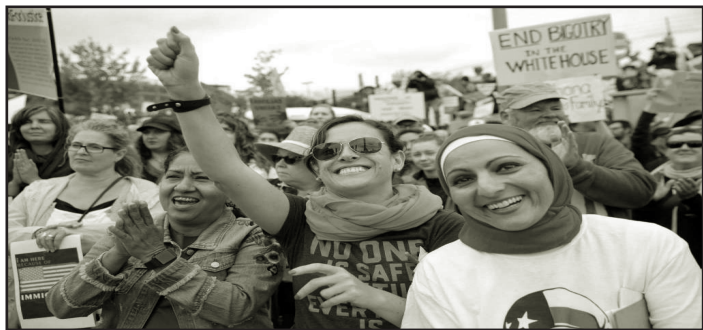
Seattle, USA., 2018. Demonstration Against Family Separation

Collective labor will fire the imagination and creativity of all. The benefits will quickly become clear to millions more around the world. These communist collectives will help workers get the training they need to spread the revolution worldwide. Many refugees will be leaders in the fight for communism wherever they settle and develop close communist ties to their fellow workers.