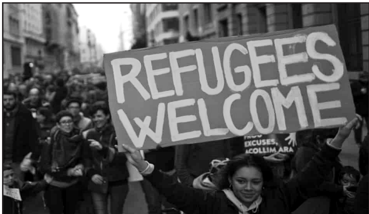
Barcelona, Spain: Tens of Thousands Demonstrate in Support of Migrants.