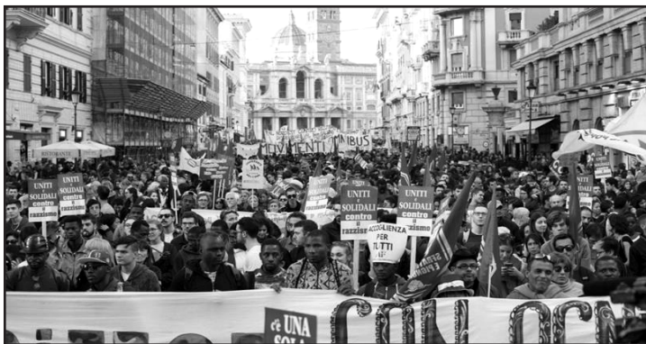
Rome, Italy November 2018: Twenty Thousand Demonstrate Against Anti-immigrant Laws