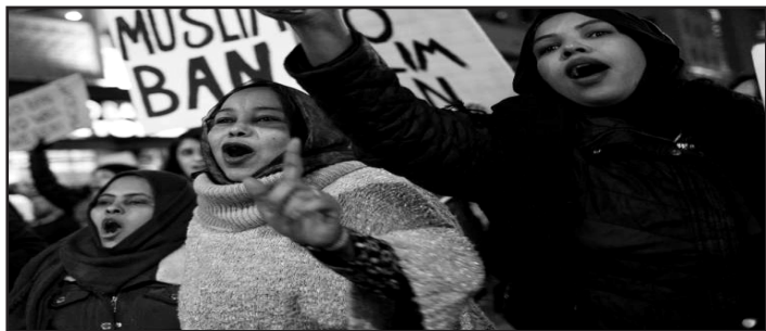
United States 2018: Demo Against Muslim Ban

Capitalism is extremely segregated. Workers are divided from students, education from work, soldiers from civilians, immigrants from native-born.