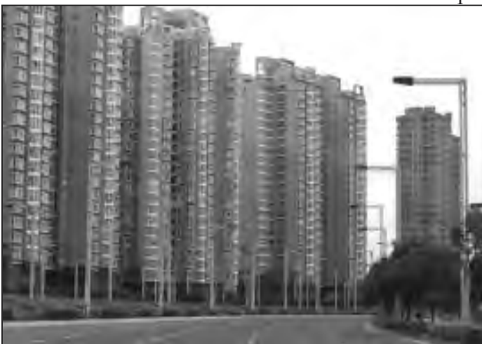
Empty apartment towers and a deserted highway in Inner Mongolia

The bosses destroy these “unusable” workers and factories through world wars. The immense scale of the present crisis means, at the very least, a sustained period of social instability. Most likely it signals the development of a third world war. Meanwhile, the awakening of billions of workers unable to live in the old way opens up the possibility of revolution for communism and the end of wage slavery. Then we'll use everyone's labor for the benefit of all!