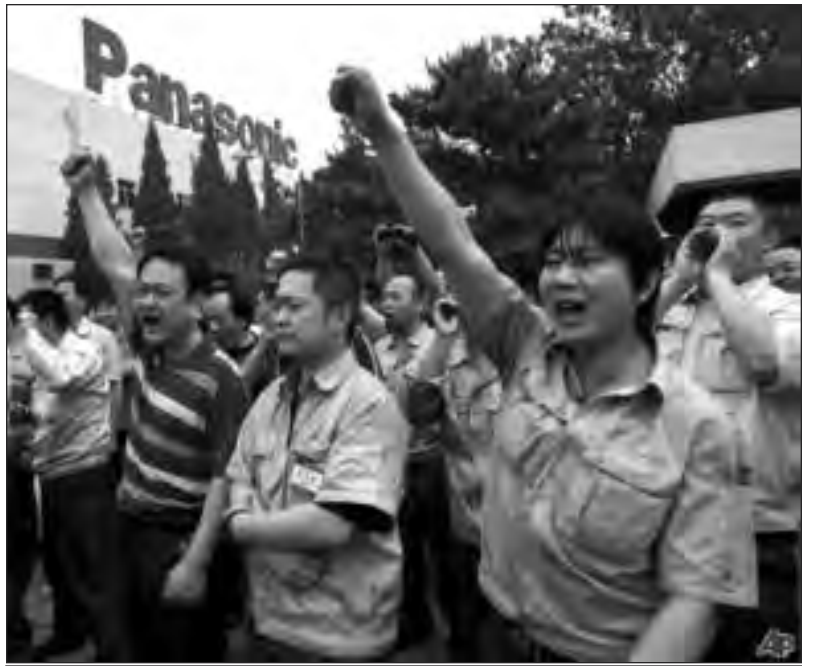
Workers on strike in Shanghai, August 2010

By 2030, wage workers may become the majority of the world's population. However, about two-thirds of them are working part-time or not at all. Twenty-three million US workers were laid off because of the crisis, and more layoffs are likely in Europe as its