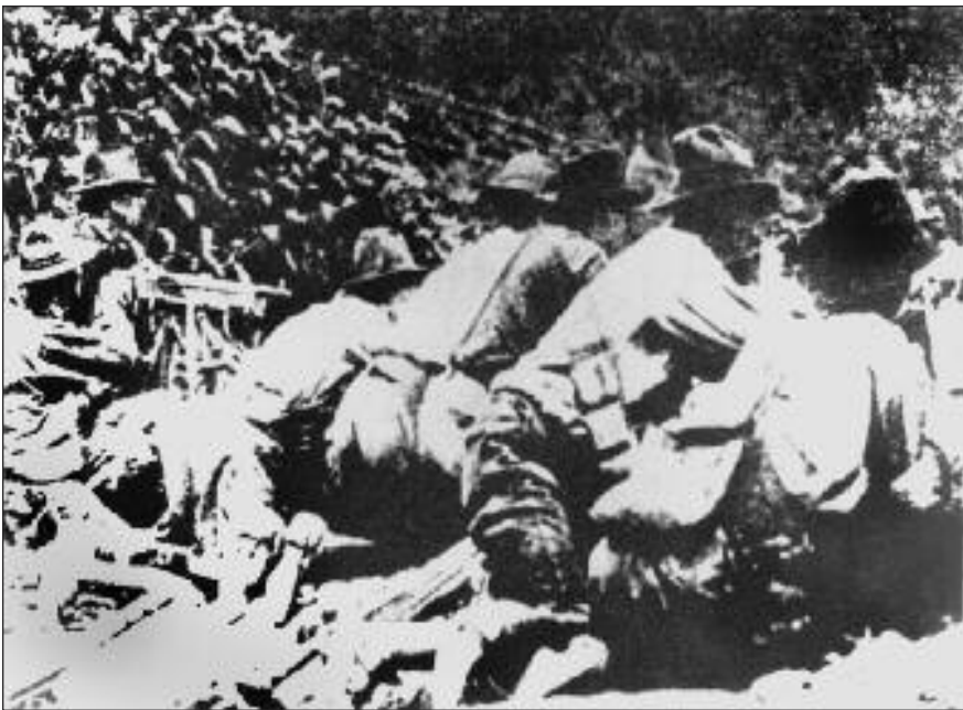
The Battle of Blair Mountain, West Virginia

It’s time for West Virginia miners, LA bus drivers, and the rest of us to lose our illusions in the impartiality of the government. We need workers’ power, where we rule society through our Party, mobilizing the masses to build a society where we organize production and distribution of goods and services for need, not for profit. But the only way we’ll get it is if we mobilize the masses for communism now, instead of being caught up in the dead-end trap of union contracts and law suits. Join us!