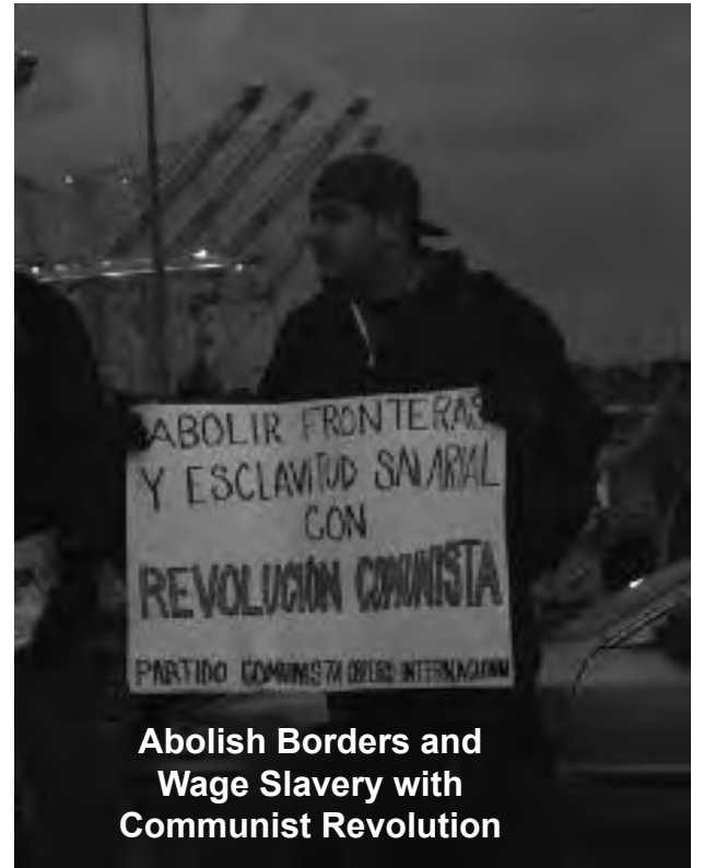
Abolish Borders and Wage Slavery with Communist Revolution

We made it a point to distribute Red Flag and MMC to the workers waiting to get in to work. One worker told us, "Good luck!" When we responded,