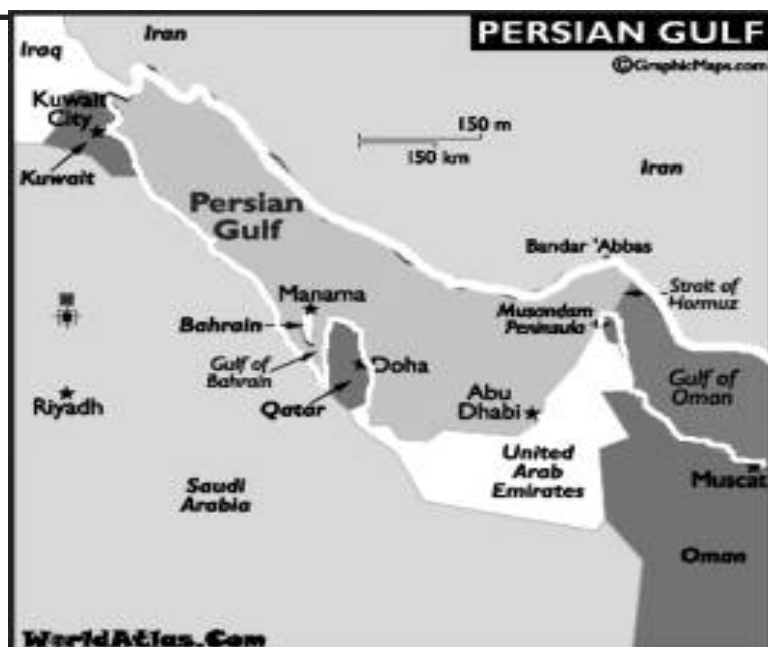
Iran threatens to close the strategic Strait of Hormuz; the US vows to keep it open.

This unilateralist section of the US bosses wants to confront Iran singlehandedly, probably believing that since neither China nor Russia can presently match US imperialism's military might, the feared global confrontation would not happen. If it happens, however, they probably speculate the US would come out on top because of its present military superiority.