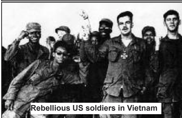
Rebellious US soldiers in Vietnam