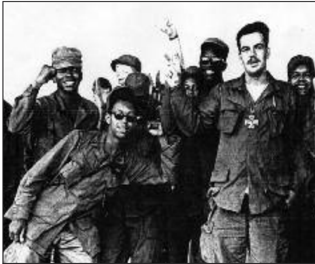
Black soldiers played a leading role in the GI rebellions that helped defeat US imperialism in Vietnam.

housing. What was not mentioned in these commercials was there would be NO JOBS waiting when these folks returned to their neighborhoods. In fact, during the eighties the C.I.A. brought in crack cocaine which brought in the war on