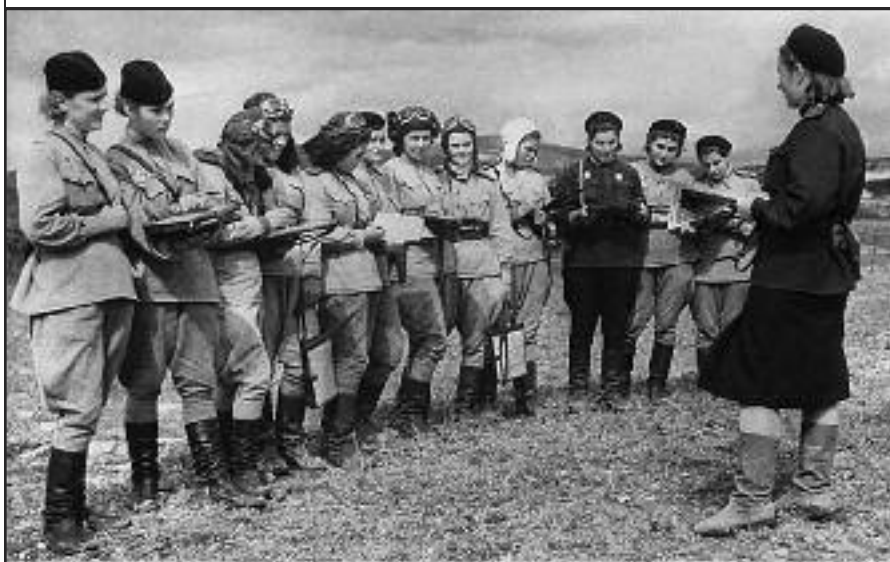
1941: Soviet female pilots helped defeat the Nazis

JOIN THE INTERNATIONAL COMMUNIST WORKERS' PARTY (ICWP) WWW.ICWPREDFLAG.ORG — (310) 487-7674 E-MAIL: ICWP@ANONYMOUSSPEECH.COM WRITE TO: P.M.B. 362 3175 S. HOOVER ST., LOS ANGELES, CA 90007, USA