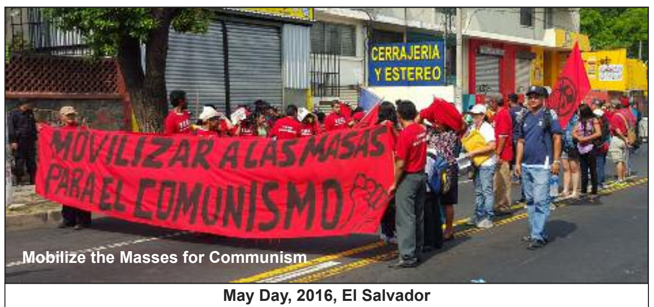
Mobilize the Masses for Communism

As members of ICWP, we optimistically take on these new challenges on the eve of celebrating seven years since the foundation of our party. We have full confidence in our line, our party, and our Red Flag , and we are convinced that we are on the correct side of history.