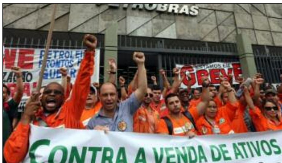
BRAZIL, Nov. 24--Oil workers begin a five-week strike against the national oil company.

In these factories we have a great potential to achieve the communist world that we need. Join us.