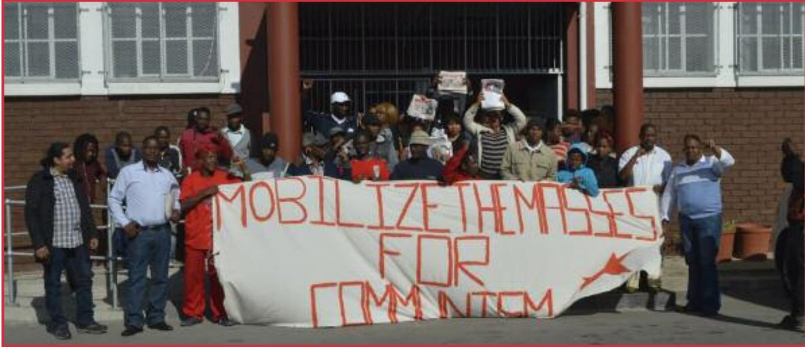
ICWP CONFERENCE IN SOUTH AFRICA, NOVEMBER 2015. BUILDING ICWP IN SOUTH AFRICA, SEE PAGE 3, 15

THE INTERNATIONAL COMMUNIST WORKERS' PARTY * WWW.ICWPREDFLAG.ORG