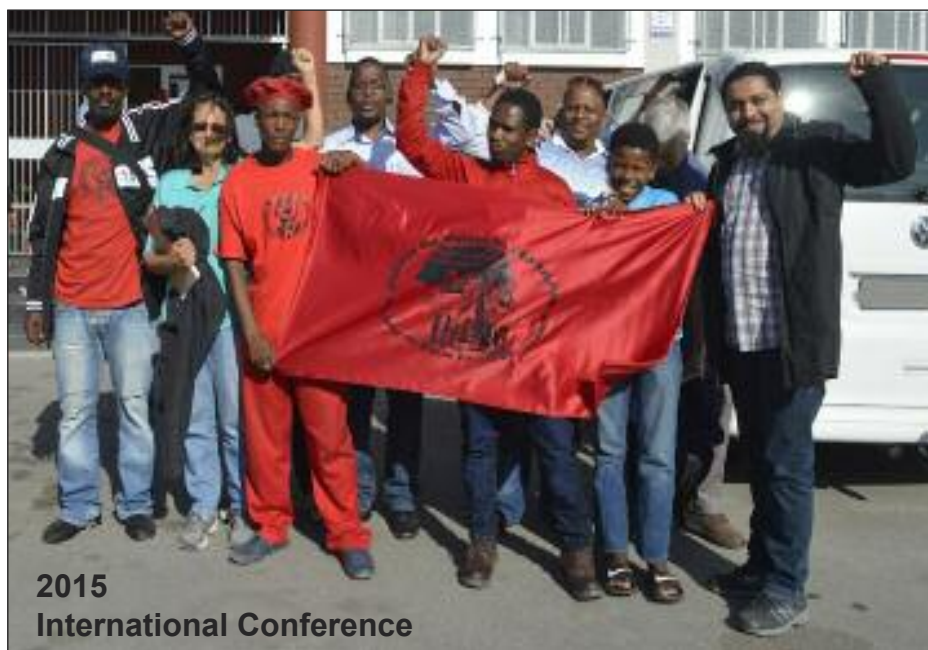
2015 International Conference

I explained why the bosses pay us the minimum wage, only paying us enough to barely survive. We can live without money. By mobilizing