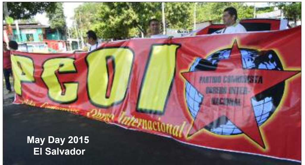
May Day 2015 El Salvador

We ended the meeting with the sharing of gifts: baskets with essential items and a photograph of with comrades from the factories committed to the struggle for Communism posing with our newspaper Red Flag as a sign of joy and clarity in the work that is being done worldwide. Finally we enjoyed a walk to the port and ate rich seafood.