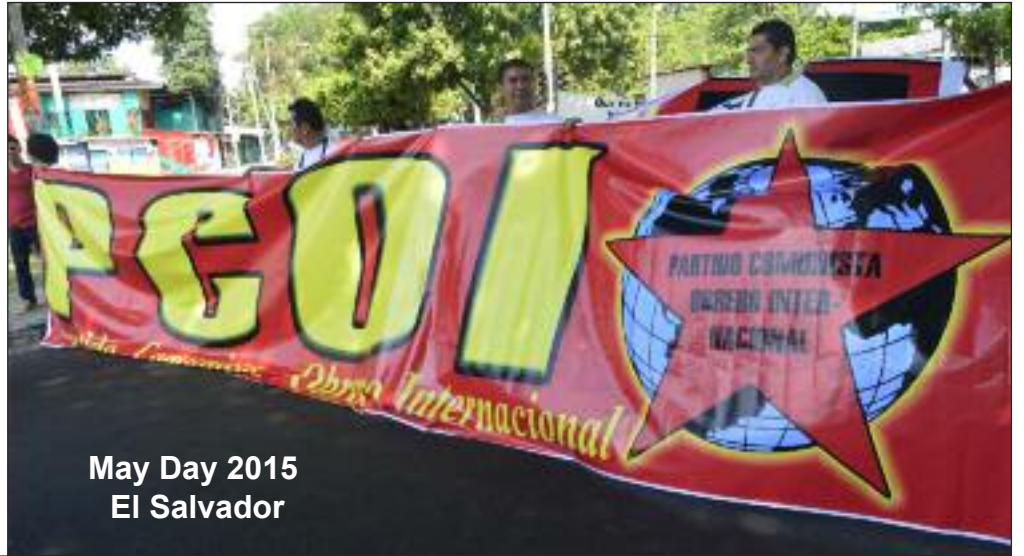
May Day 2015 El Salvador

We ended the meeting with the sharing of gifts: baskets with essential items and a photograph of with comrades from the factories committed to the struggle for Communism posing with our newspaper Red Flag as a sign of joy and clarity in the work that is being done worldwide. Finally we enjoyed a walk to the port and ate rich seafood.