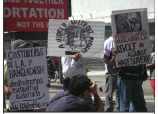
Garment Workers in Los Angeles

The RAF (British Royal Air Force) personnel stationed in India were responsible for expediting India's independence. Basically they rebelled against the government citing that they had fought for freedom and it was unacceptable that they should be asked to operate as oppressors. The RAF mutiny occurred throughout the Empire and in Britain. It has been hushed up, of course. My father was in the RAF at the time between 1947 and 1949. It became so re-