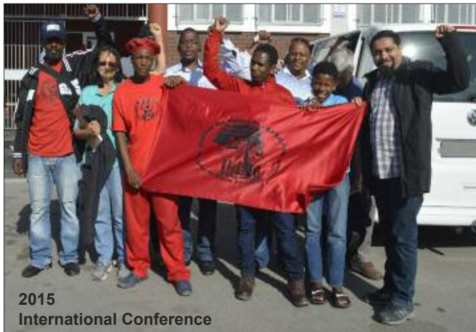
2015 International Conference

I explained why the bosses pay us the minimum wage, only paying us enough to barely survive. We can live without money. By mobilizing