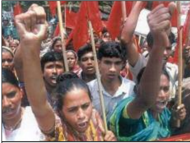
Bangladesh: Garment workers

The last paragraph of the letter says, “One of the other conclusions he drew from his war experiences was an emphatic, ‘No son of mine is