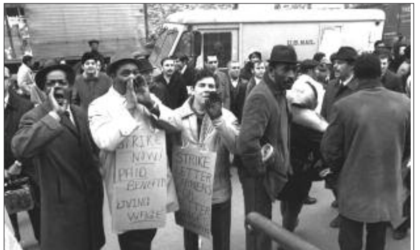
1970: Nationwide Strike shut down US Postal Service

We're not just dreaming. We're distributing Red Flag and Mobilizing the Masses for Communism to postal workers and talking with them. The growing attacks on us make it more urgent to spread the fight for communism. We're working to mobilize the masses to think about and organize to get rid of racist capitalism with communist revolution worldwide, and how to build our new society. Join us!