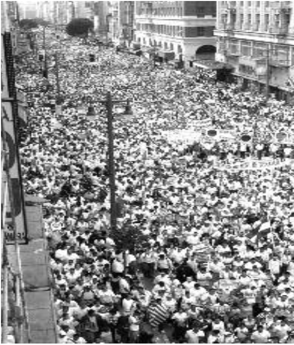
Los Angeles: One million marchers protest attacks on immigrants, 2006

THE NEWSPAPER OF THE INTERNATIONAL COMMUNIST WORKERS' PARTY * WWW.ICWPREDFLAG.ORG