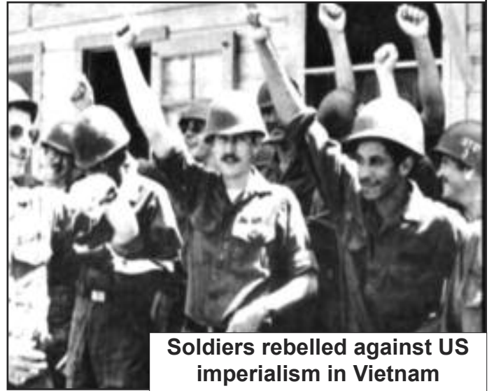
Soldiers rebelled against US imperialism in Vietnam

"Hey, I heard that your son is in the army. Where is he stationed?" a co-worker and Red Flag reader asked me.