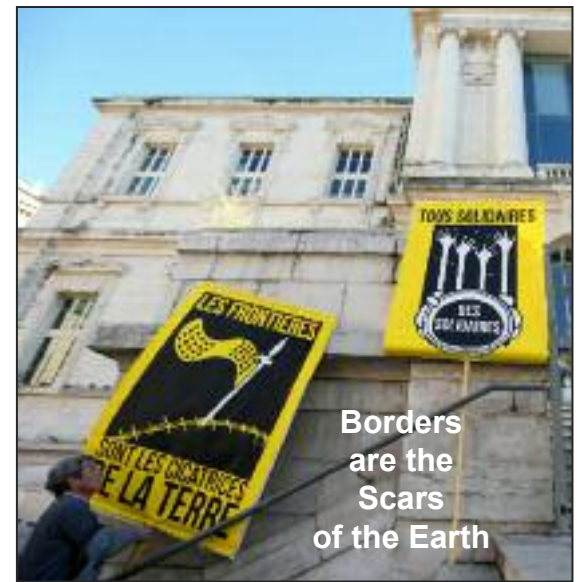
Borders are the Scars of the Earth