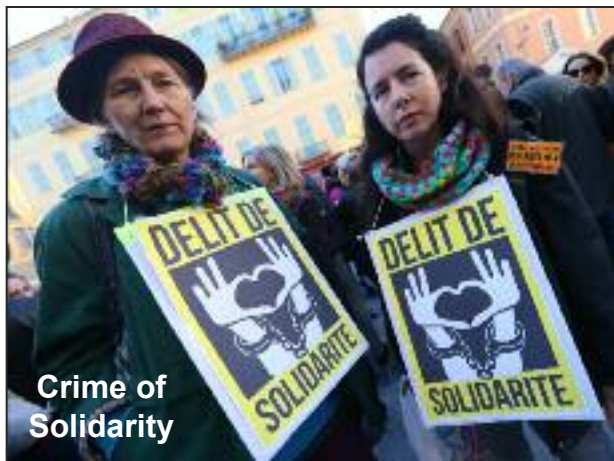
Crime of Solidarity

Humans have always migrated, populating the whole world from our birth place in Africa. Migration will not stop under communism. A communist world will encourage migration to integrate society locally and worldwide. Everyone will be welcomed as visitors or as permanent members of the society where they choose to visit