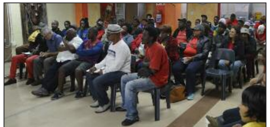
ICWP Conference in South Africa

He didn’t know anything about dialectics but when I explained, everything was clear to him. He used to work in another area, then he joined NUMSA. Then he was appointed shop steward, then he went up the ranks, and now he’s working for the union.