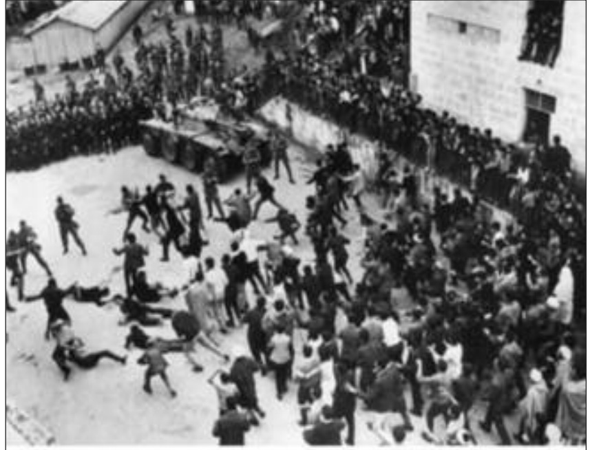
Algiers residents confront French tanks, 1960s

We described how we carried on a mass ideological struggle for six months before being able to lead a series of rebellions at Ft. Lewis (now Joint Base Lewis-McChord). We wrote and discussed how racism hurt us all, how we needed anti-racist unity to fight back against the brass and their imperialist masters. We exposed partic-