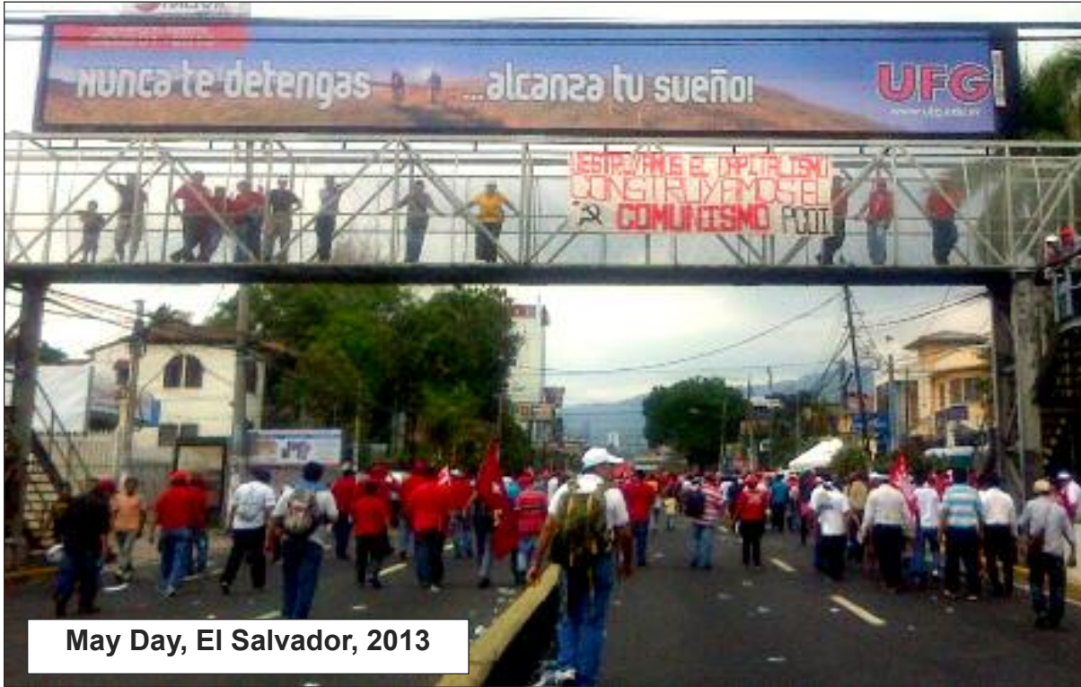
May Day, El Salvador, 2013

The elections that will be held on March 1st of this year to elect the mayors and deputies will not spark the enthusiasm of the working class. Every-