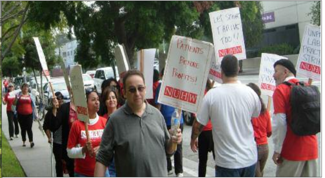
LOS ANGELES, January 12—Social workers and other Kaiser workers began a week-long strike for better staffing and against benefit cutbacks. About 140 strikers took Red Flag during the week. One worker made and distributed copies of our article about Kaiser. Many had serious conversations about capitalist and communist health care with ICWP comrades on the picket lines.