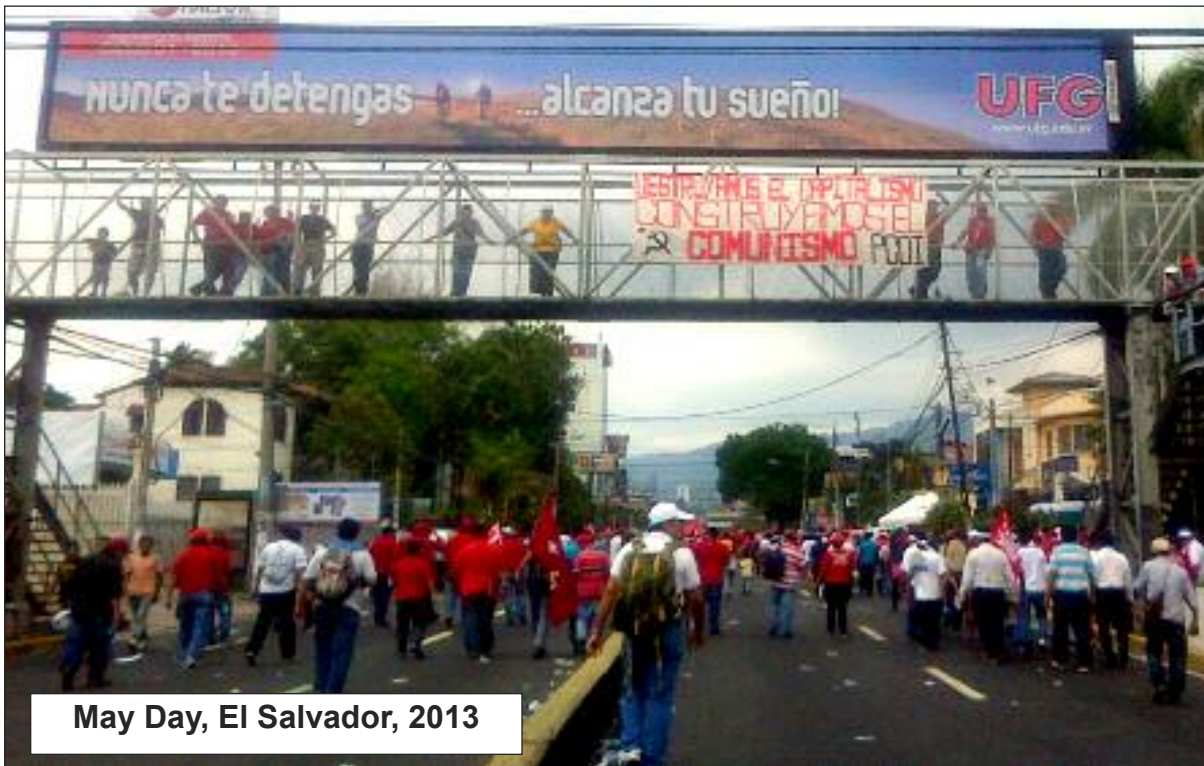
May Day, El Salvador, 2013

The elections that will be held on March 1st of this year to elect the mayors and deputies will not spark the enthusiasm of the working class. Every-