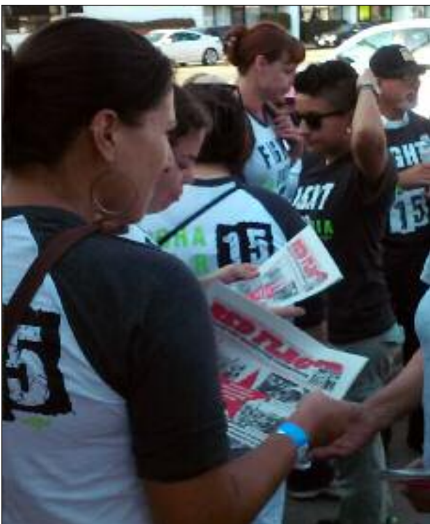
Los Angeles, Fall 2013