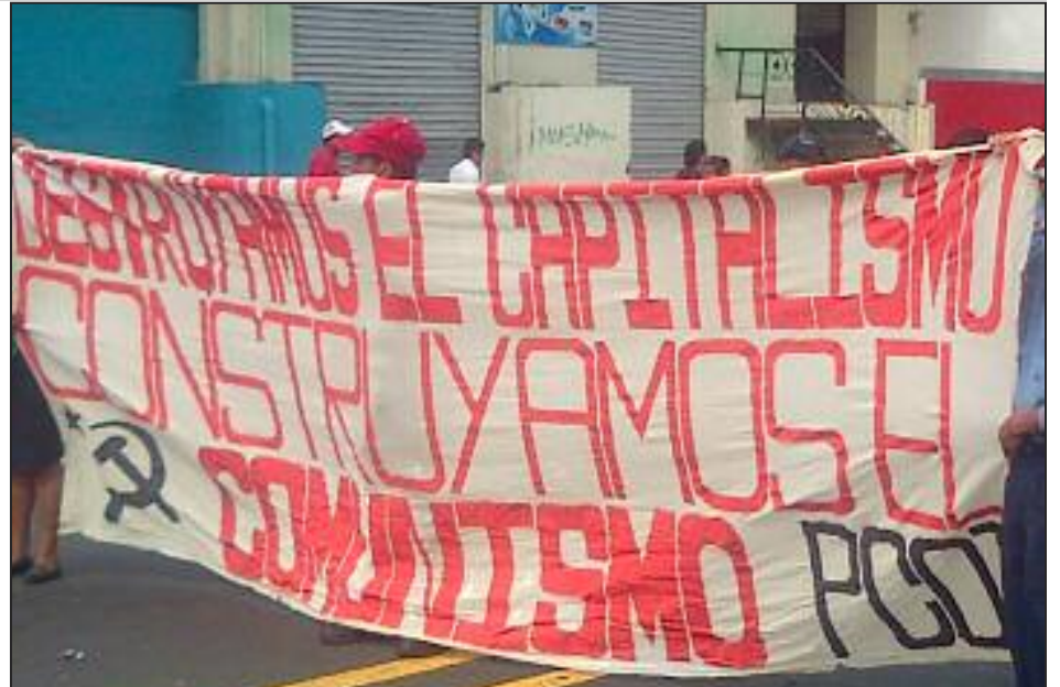
“Let’s Destroy Capitalism, Let’s Build Communism ICWP

Besides this, dialectics teaches us that during the struggle for power by the Red Army, led by ICWP, during the taking of power by the working