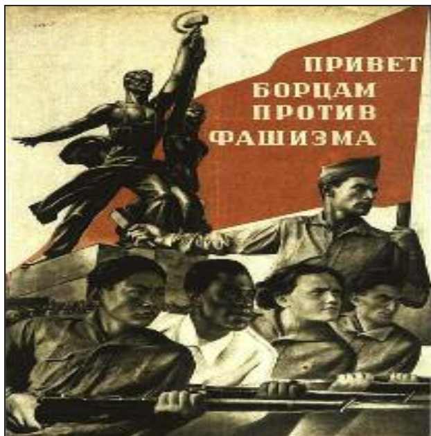
GREETINGS TO THE ANTI-FASCIST FIGHTERS

Fascism lifts up a "strong man." Communism lifts up the masses.