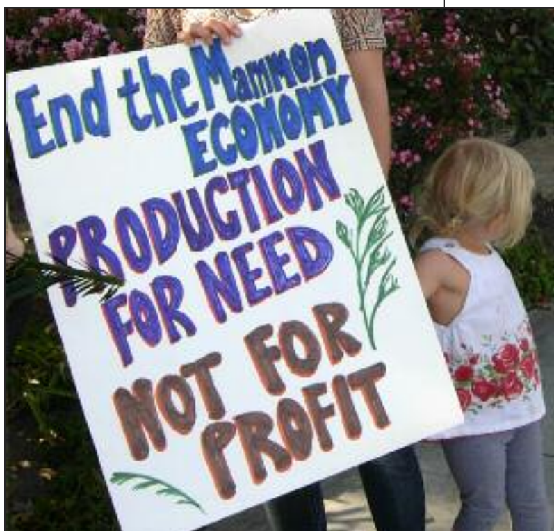
Christian peace walk, March, 2013—Communist ideas can become mass ideas!

A NEW DAWN IS COMING!!! —Male construction worker