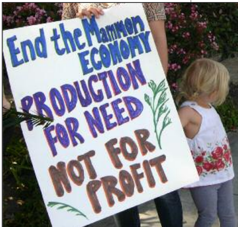
Christian peace walk, March, 2013—Communist ideas can become mass ideas!

Note: The New Testament depicts Mammon as an evil spirit of material wealth and greed.