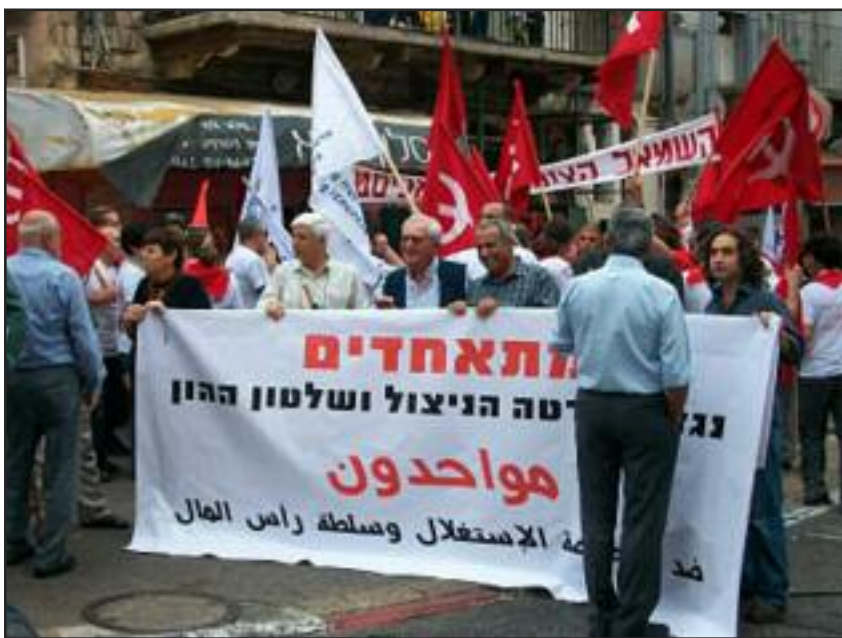
“Uniting against privatization, exploitation, and capitalistic rule.” May Day 2010, Haifa, Israel

The liberal Israeli dream of a “democratic SEE Palestine, page 4