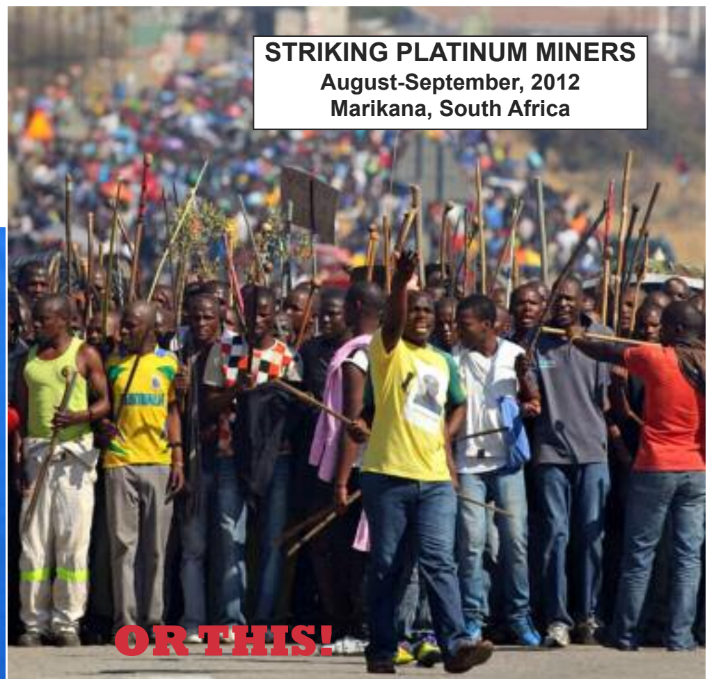
STRIKING PLATINUM MINERS August-September, 2012 Marikana, South Africa