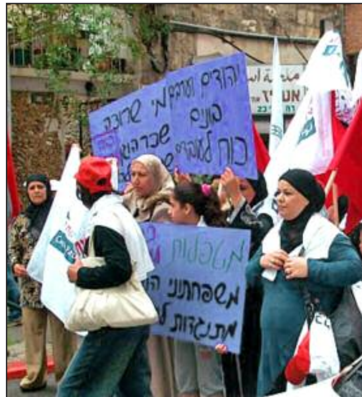
“Jews and Arabs building power for the workers” -- May Day 2010, Haifa, Israel

The powerful Hart-Rudman Commission stated in 2001 that “If the United States mismanages its current global position, it could leave us more isolated