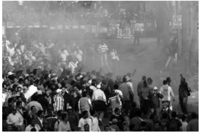
Mexico City, April 2011--Workers fired from Central Power and Light who demand their jobs back face riot squad cops, the protectors of capitalism.

Millions of us workers need to participate in this struggle and to keep up our physical and mental wellbeing, as we fight for that of future generations. Let's organize ICWP and participate in spreading Red Flag .