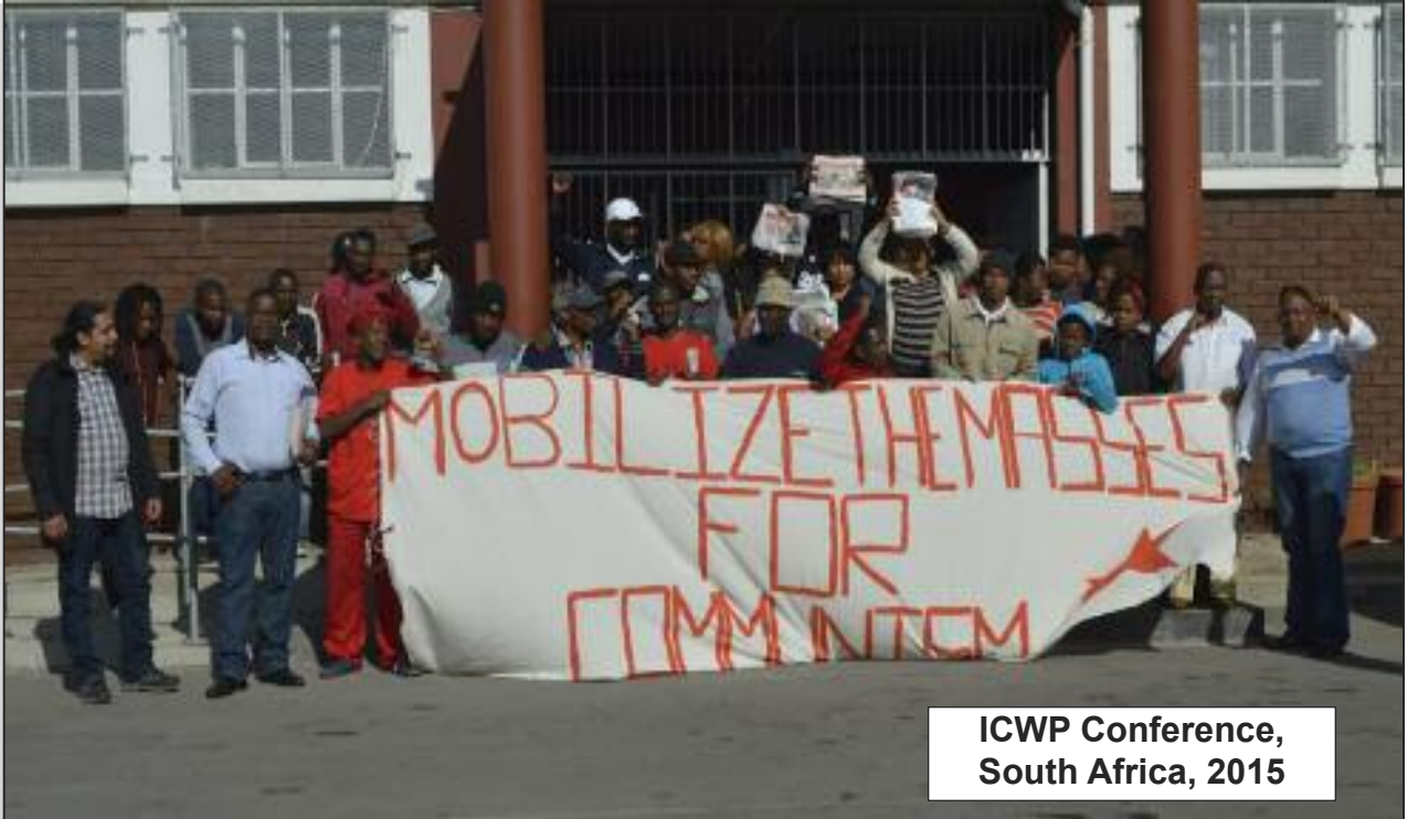
ICWP Conference, South Africa, 2015

So it’s important that we don’t let these differences manifest themselves in a way that will impact negatively on the party. So we