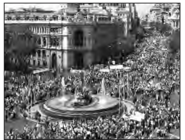
May Day, Madrid, 2011