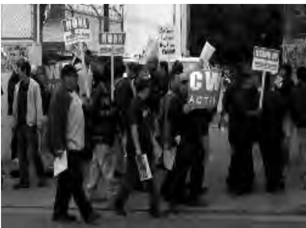
Technicians locked out by ATT

Red Flag responds: We thank the writer for this helpful letter and agree that the commitment of the troops is primary. What we meant to say in the editorial is that without an industrial base, a ruling class can't even aspire to be an imperialist power.