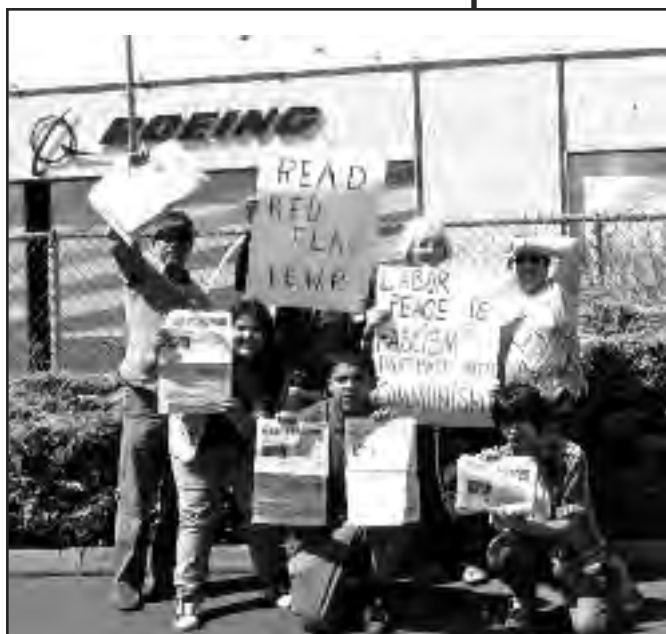
ICWP 2010 Summer Project brings communist ideas to Boeing workers

This has been one of our best vacations. In this battle we won 4 to 0. We hope that in the coming visit the score will be higher.