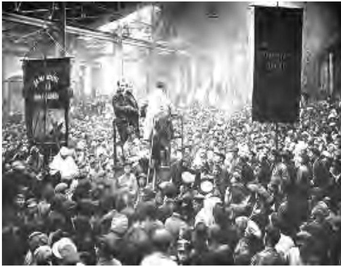
Putilov workers meet inside the factory, 1905

All Red Flag readers should study this book. But we now understand the central role of a disciplined, mass communist Party more profoundly than the