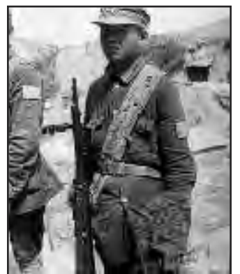
During the Chinese Revolution, soldiers were not divided by rank or wages

The lessons from the courageous Chinese movement are critical to us as we fight to build a communist society today.