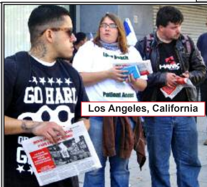
Los Angeles, California