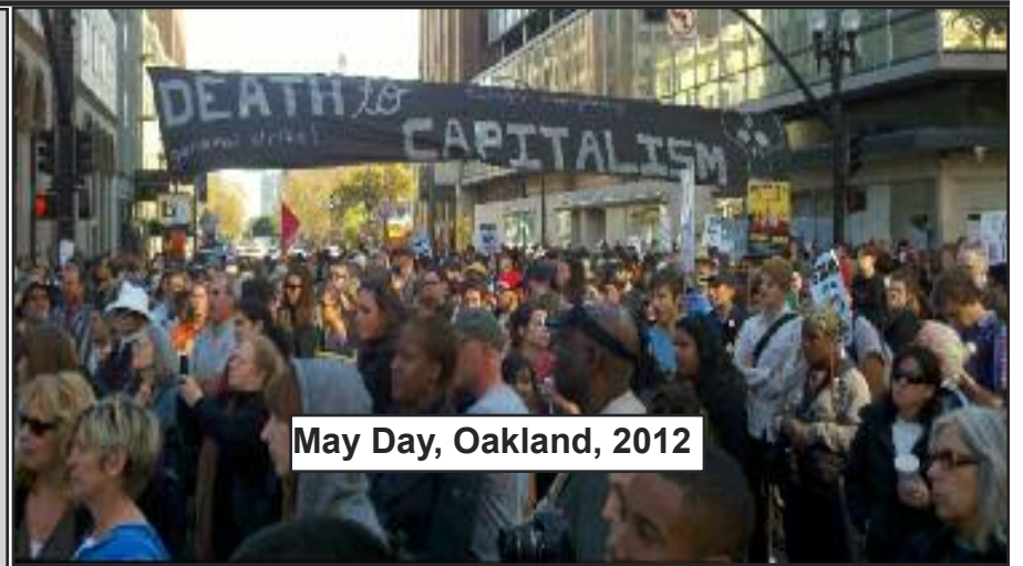
May Day, Oakland, 2012

In Oakland, we found that the strategy that suited capital was to divide and scatter the movement among various demonstrations. We were able to go to two of them. One was a demonstration of high school students at the Federal Building against deportations. The main demonstration in downtown Oakland, much smaller than last year, included union members from SEIU as well as workers on strike from the Mi Pueblo chain of grocery stores. At both of these demonstrations we found that workers were very receptive to Red Flag's message of "Production for need, not for profit! Fight for a world without borders, wage slavery, racism, sexism, and imperialist wars," which was in sharp contrast with the reformist messages of the protests.