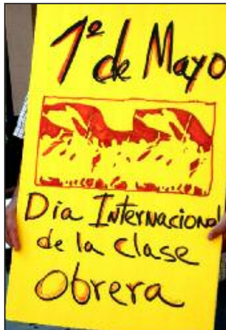
May Day: International Workers’Day

We agreed to talk more here too, even as she prepared to go on an organizing trip for the union.