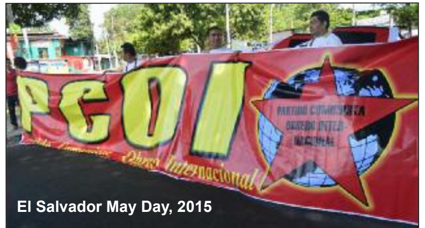
El Salvador May Day, 2015

In Communism the working class will collectively lead the society, ending personal wealth which is the product of exploitation. Men and women will produce according to what is needed.