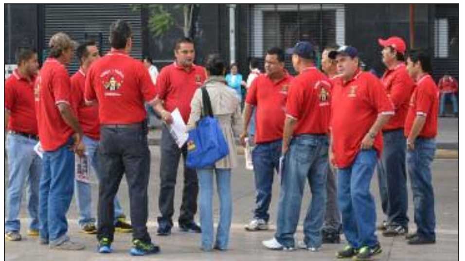
May Day, Mexico City, 2014

Knowledge will not be concentrated in the hands of a few “intellectuals” who think they know everything. It won’t just be a lucky few