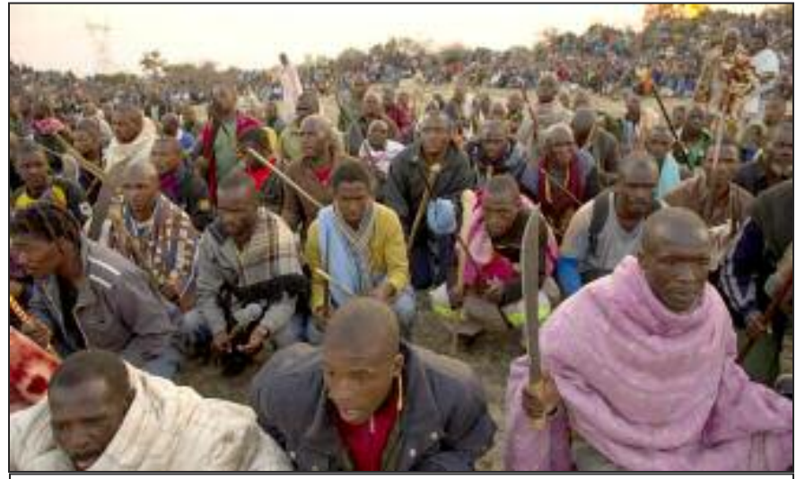
Marikana miners, South Africa, August 2012

"We have to work hard to build the party. I went to the workers far from where I live and distributed Red Flag ," said a comrade as she described her experience of building the party.