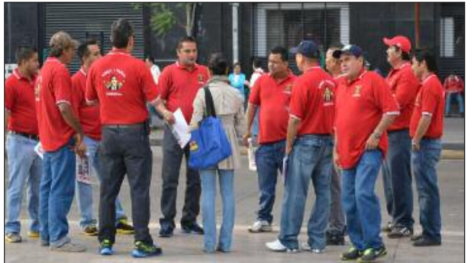
May Day, Mexico City, 2014

Knowledge will not be concentrated in the hands of a few “intellectuals” who think they know everything. It won’t just be a lucky few