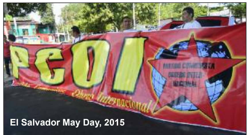
El Salvador May Day, 2015

In Communism the working class will collectively lead the society, ending personal wealth which is the product of exploitation. Men and women will produce according to what is needed.