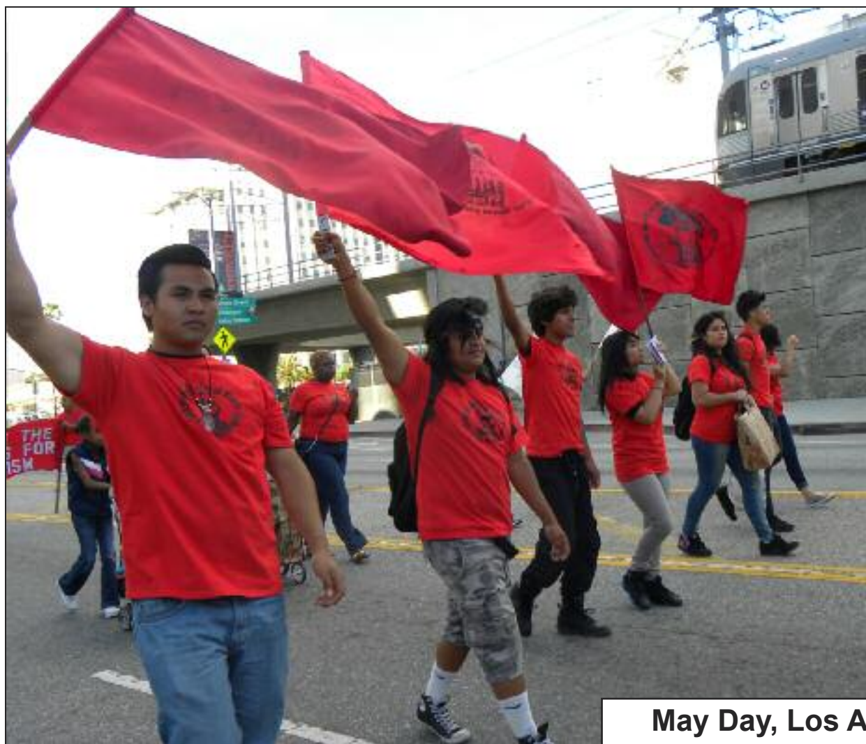
May Day, Los Angeles, 2015