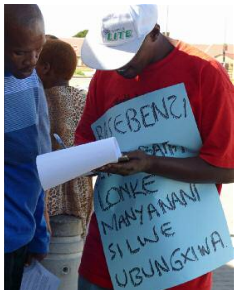
Comrade in South Africa organizing for May Day, 2015 Sign in Xhosa says "Workers of the Unite for Communist Revolution"