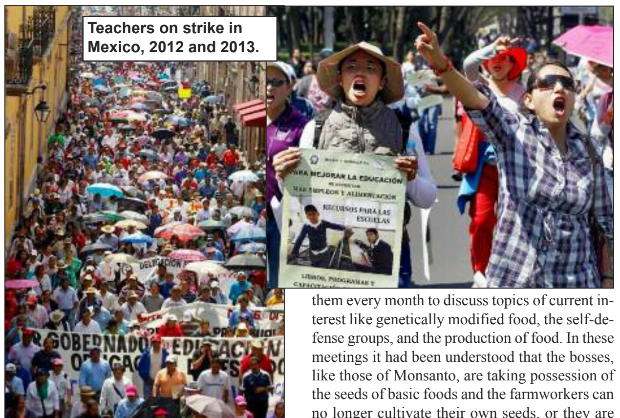
Teachers on strike in Mexico, 2012 and 2013.

The way we can confront these problems is by organizing ourselves into an international party of the working class. The members of ICWP in