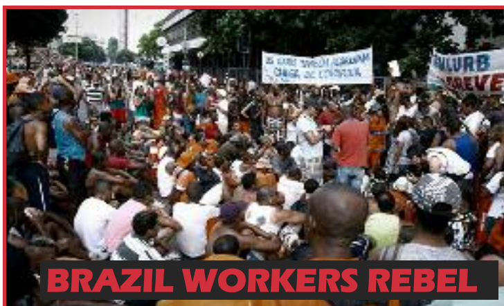
BRAZIL WORKERS REBEL