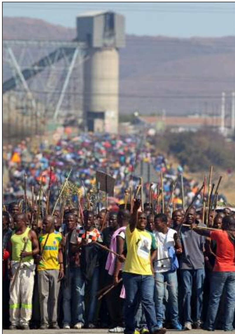
The August 2012 murder of dozens of miners in Marikana definitively exposed the African National Congress' betrayal of the struggle against apartheid. It brings into sharp focus the need to build ICWP in South Africa.

Reformists always peddle the lie that absolves capitalism and blames it on a skewed type of capitalism. We are not fooled with these schemes. We've seen them all and we are not deterred. We remain firm and resolute in our class struggle fight against capitalism and all its manifestations. That is why we are convinced that ICWP, the International Communist Workers' Party, is the only party that pushes the correct political line of a communist revolution. On May 1, ICWP members in South Africa will participate in a mass demonstration to massify our line of communist revolution.