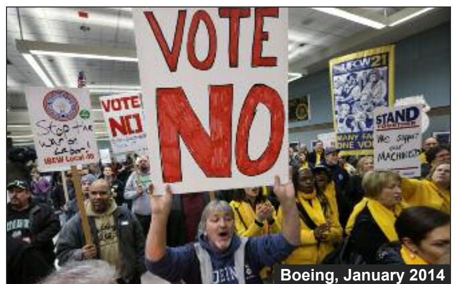
Boeing, January 2014

Bring the red flag to May Day! We invite all to join us in mobilizing the masses for communism — in the streets and in the plants.