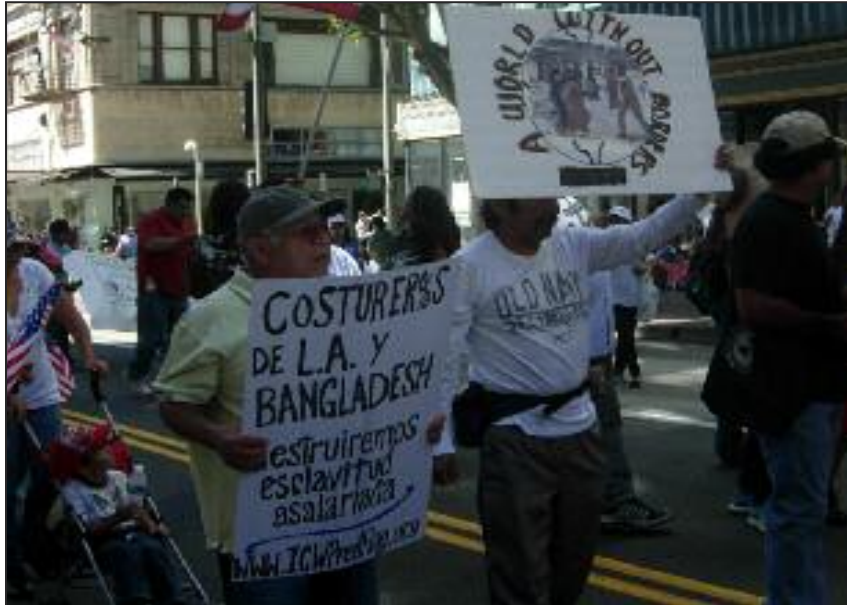
Garment workers from Los Angeles to Bangladesh give leadership to the fight for a communist world

Our goal is the struggle to mobilize the masses for communism and to end exploitative capitalism once and for all. Over a thousand copies of every edition of Red Flag are distributed among Los Angeles garment workers. Many of them will help to build a new world without wage slavery, a world without borders.