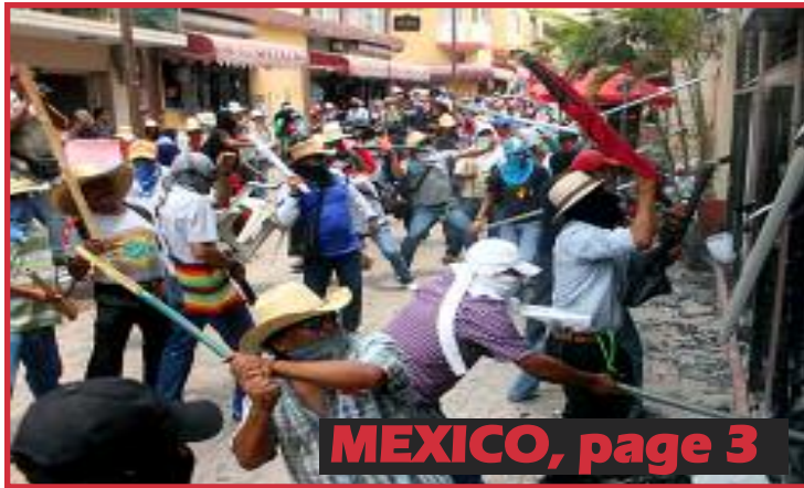
MEXICO, page 3