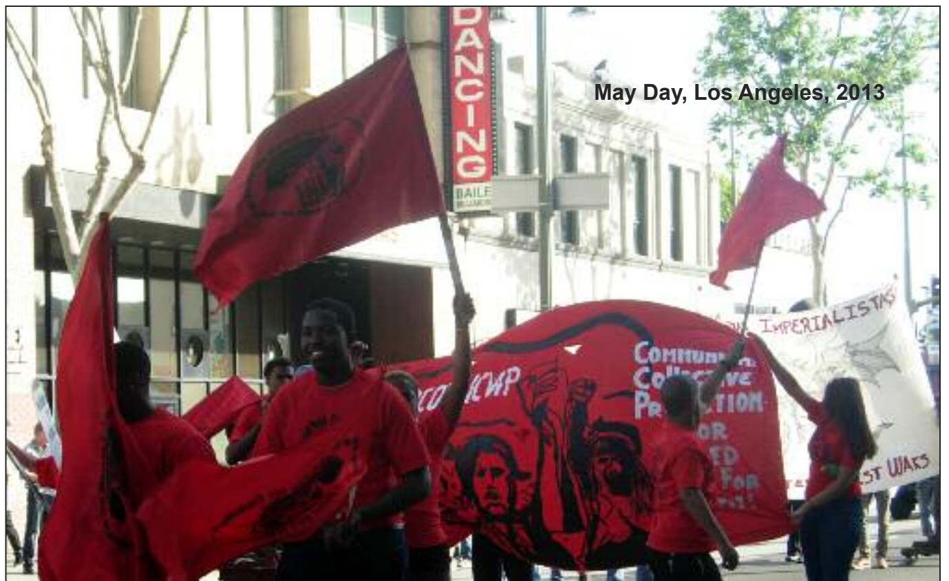
May Day, Los Angeles, 2013

“The dinner motivated me when I saw that all over the world many have the same idea of being equal and that not only one race has that idea but that there are communists of all races. And that means that all can be convinced of what is better for humanity. I really liked it a lot being with other people that have communist ideas like myself.”