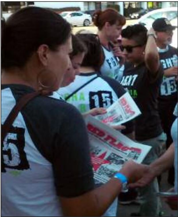
Union activists in $15/hour campaign in Los Angeles, October 2013

SEATTLE, WA, April 16 — “Boeing’s transfer of 1,000 engineering jobs to California ... has sown widespread dissent [and] distrust,” shouts the front page of the Seattle Times .