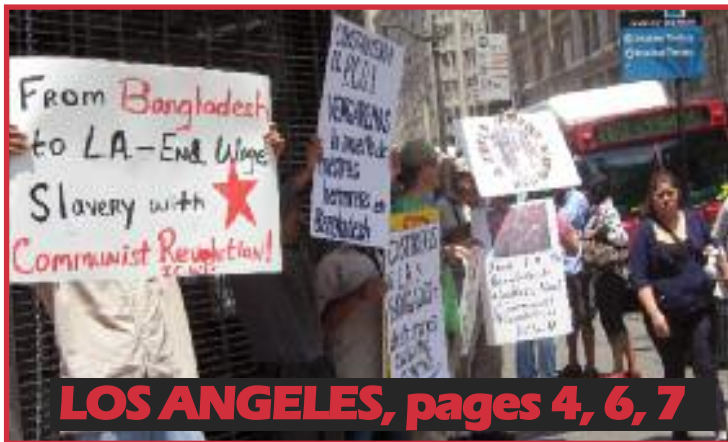
LOS ANGELES, pages 4, 6, 7