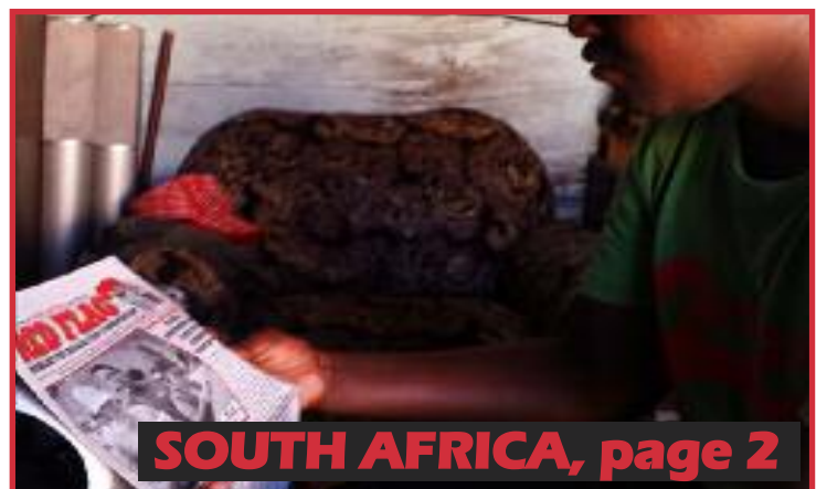
SOUTH AFRICA, page 2

As we celebrate the fifth May Day of the International Communist Workers' Party, our industrial worker comrades in South Africa are showing the urgency and possibility of mobilizing the masses for communism.