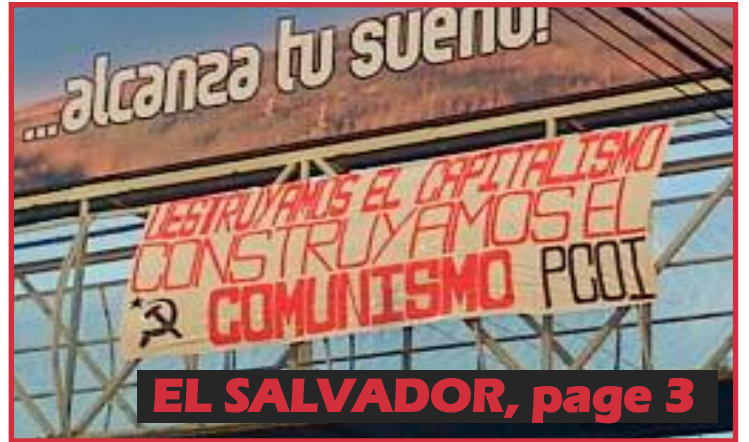
EL SALVADOR, page 3