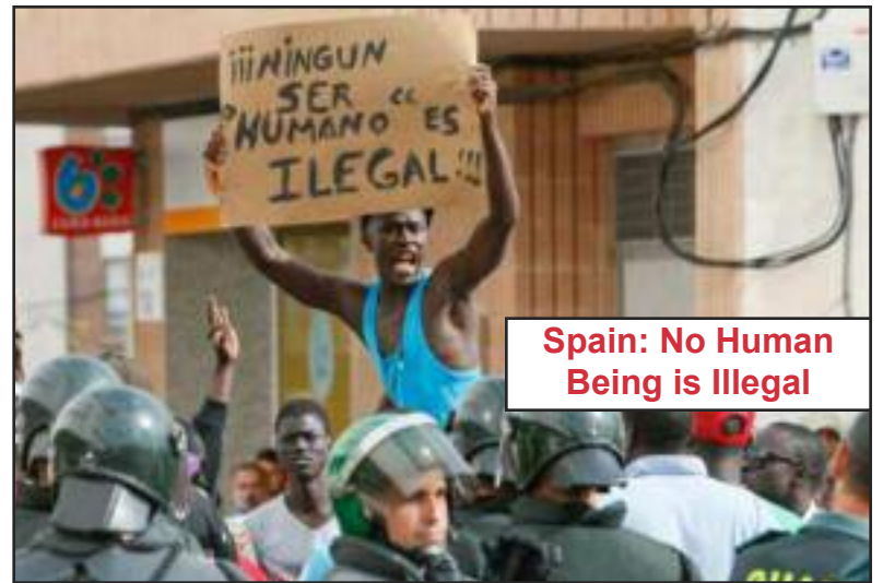
Spain: No Human Being is Illegal

Still, until the 20th century, few capitalists had the resources to control their borders. Checkpoints on major rivers, railways and highways gave them greater population control, but most borders have always been relatively porous. Today the bosses open and close their borders to allow or stop the flow of immigrants according to their economic, political, and military interests.