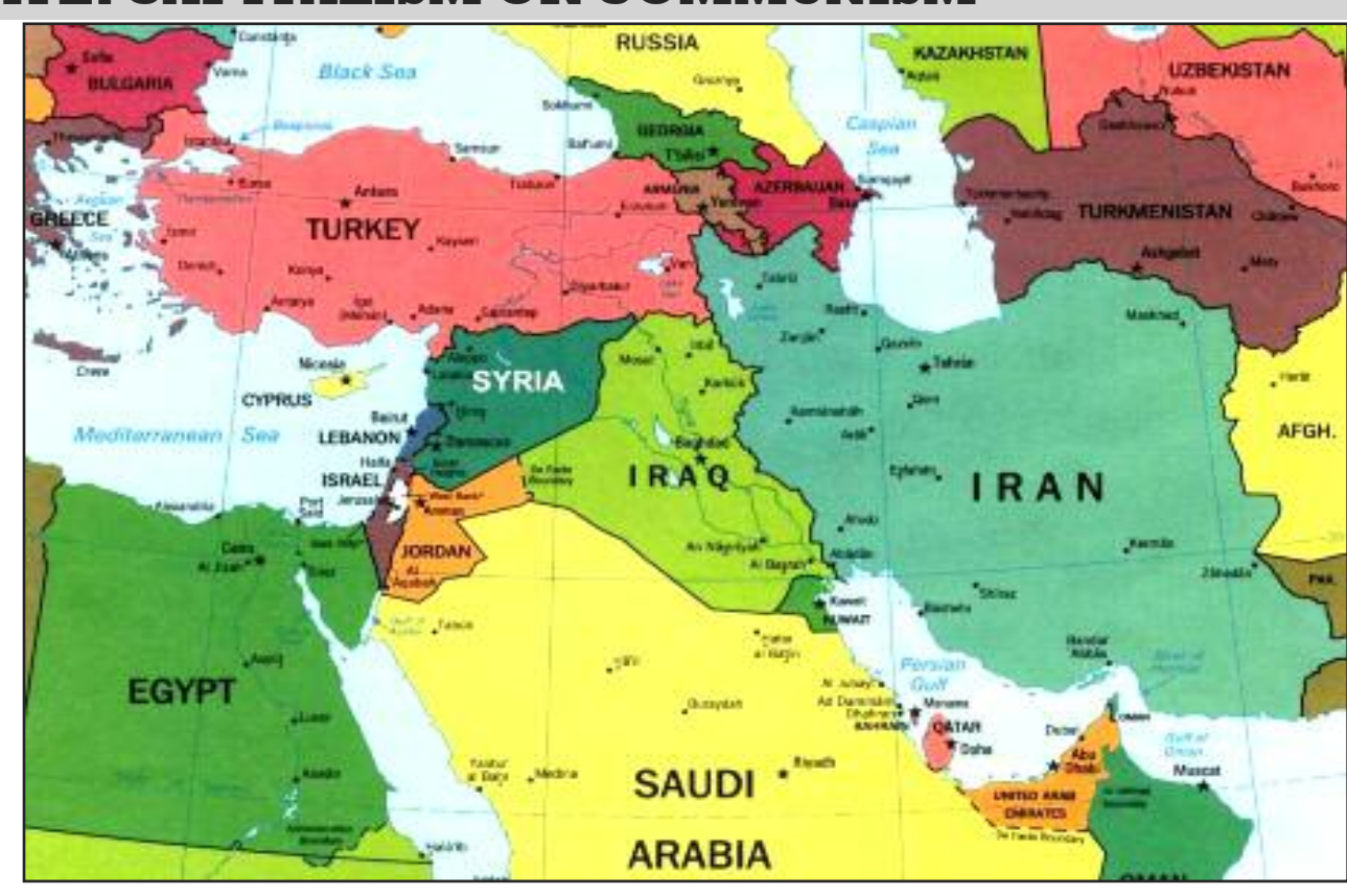
No US vital interests are at risk in the Middle East

If successful, this would give US imperialism full control of Middle Eastern and Central Asian energy resources, which they would then use to flood the world's oil markets, bankrupting energy powerhouses like Russia and Venezuela. China's economic and military energy needs would then be captive of the US bosses' whims. Once again, US imperialism would be the undisputed ruler of the world.