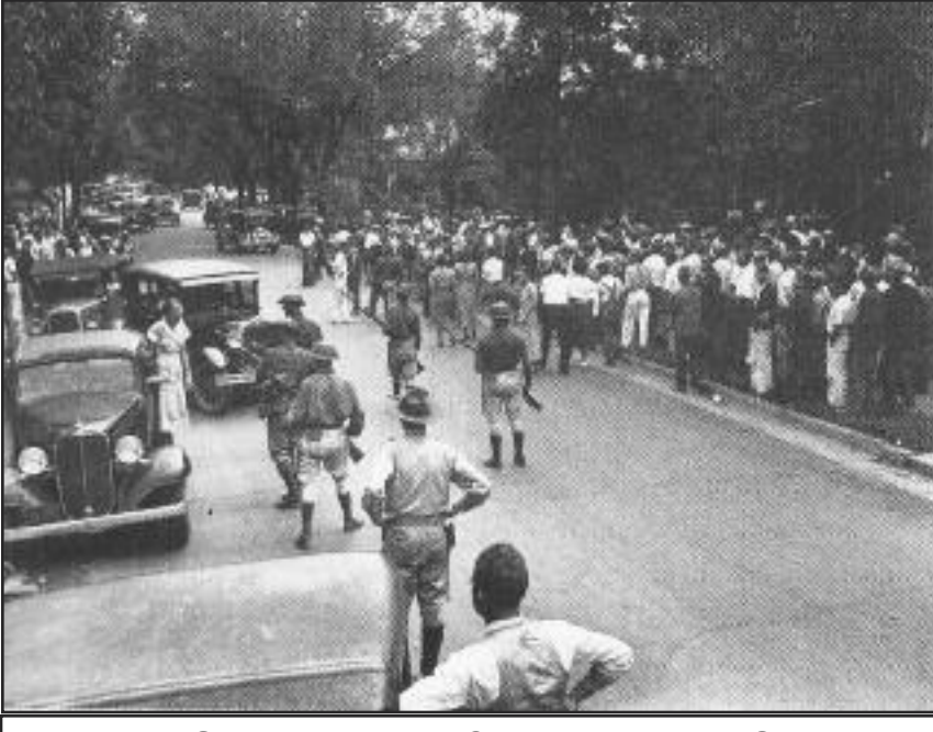
1929 Gastonia, North Carolina, Textile Strike

Tens of thousands complained to the TLRB. It issued whitewashed reports on the progress of these complaints.