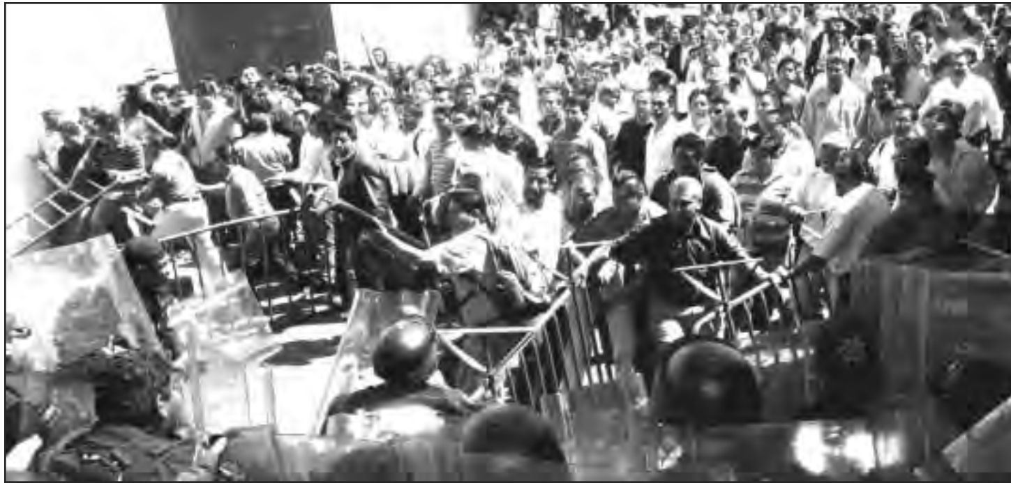
Oaxaca Teachers Fight Cops, March, 2011

Capitalism is incapable of meeting workers needs from Oaxaca to Honduras to Cairo. It has to be destroyed. Teachers’, workers’ and students’ most urgent need is to mobilize for our own interests—to fight for a communist world where we will organize education, production and distribution solely to meet the needs of the working class, not any boss. Teachers in Mexico, Honduras, the US and all over the world face the same attacks. The bosses are creating the objective conditions for us to unite to face the same enemy. We need to unite for communism. For that we need to spread Red Flag and build the ICWP to unite our class internationally. (More on this struggle in the next edition.)