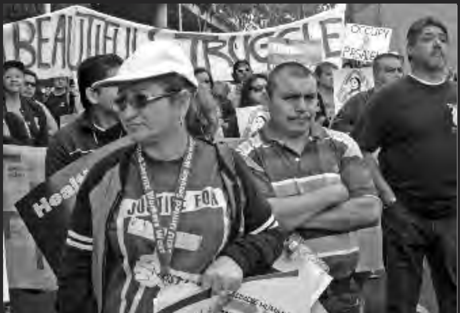
May 1 — Occupy Pasadena defies bosses' efforts to separate May Day activities, joining Burbank rally for recycling workers and Los Angeles immigrant-rights marches. Copies of Red Flag and Mobilize the Masses for Communism were eagerly received everywhere. Earlier, at a morning rush-hour rally in Pasadena, chants of "Whose country? Our country!" competed with "Whose world? Our world!" Contradictions within the movement became clear as "May Day, Workers' Day" became "May Day, Workers' Rights" and then "May Day, Workers' Power!"

I have made a few contacts and one who I believe will be the next to join ICWP. This individ-