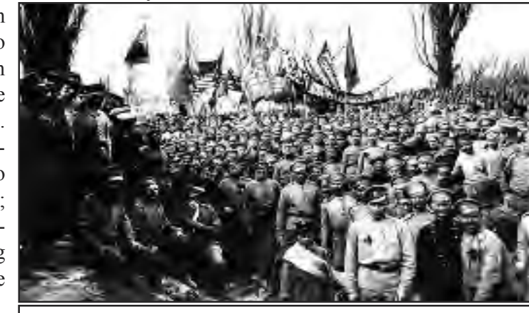
Communist Work Among the Czar's Soldiers Was Crucial in the Russian Revolution

We have been fooled into believing that the government is the only one with all the power. The government represents the capitalists, and they hold power through their control of the state: the army, the cops, courts, laws, Congress, the press, etc. But the masses ourselves potentially hold the power; however, we need to realize this. Without the bus driver operating the bus, without the student making a new discovery and without the soldier stepping into the combat field, the government has no power. We must organize to take power for our class, to run everything in the interests of the workers of the world, not for any bosses. We must organize a revolution and a communist society where bus drivers can organize a transit system that meets our needs, not for profit. Students can learn and use our knowledge to improve things for all. We soldiers can unite with workers and students worldwide and help lead a revolution and a Red Army to liberate workers everywhere.