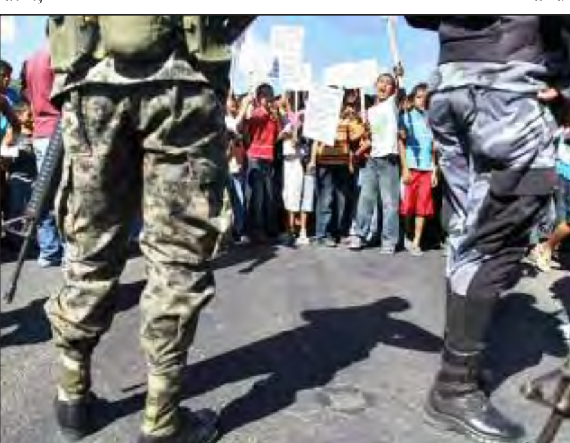
Honduras: youth protest fascist attacks on their communities.

Honduran workers hate this racist capitalist system. They courageously burned down government buildings in Ahuas, demanding the expulsion of the US DEA agents. Now, they need to realize their potential to destroy capitalism with a communist revolution by joining and building ICWP.