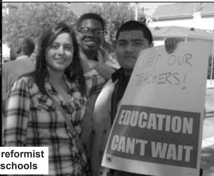
Fighting against reformist illusions in the schools