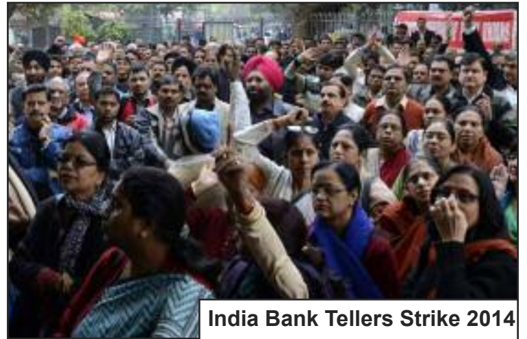
India Bank Tellers Strike 2014

Exposing Modi's fascism alone will not liberate the working class. The International Communist Workers' Party (ICWP) has been patiently struggling to win workers and students in India to fight for communist revolution by joining our party. The working class has no other option to fight for the world we need. India has the world's second-largest standing army, comprised of soldiers who come from the most oppressed working class families. Our goal is to win these soldiers to unite with the working class to smash the capitalist profit system and build communism.