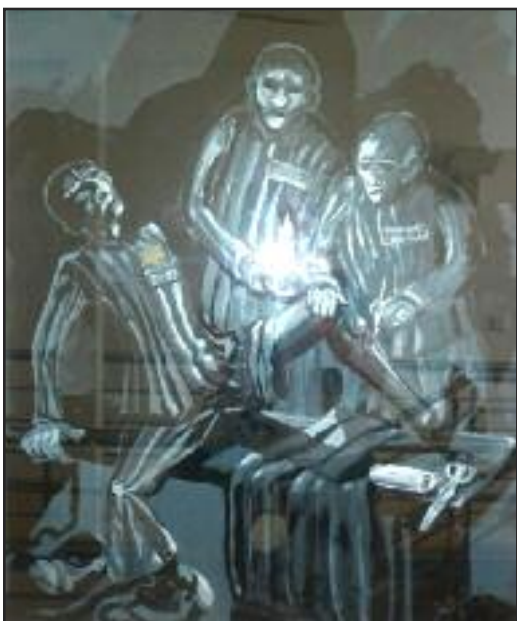
The picture above, drawn from memory by a survivor of the Saschenhausen Concentration Camp near Berlin, shows Communist prisoners (identified by the red triangles on their uniforms) secretly performing surgery by candlelight on a Jewish prisoner (identified by his yellow Star-of-David). It shows the unity of Jewish and Communist prisoners in the Resistance.

It's no surprise that a movie shown on TV in the US would leave out the role of communists. But our critique of the communist movement in the 20th century—that they didn't get rid of the system that breeds fascism—shouldn't lead us to making that mistake. Their heroism and principled class struggle provide us with plenty of lessons we can learn for the fight ahead for a communist world.