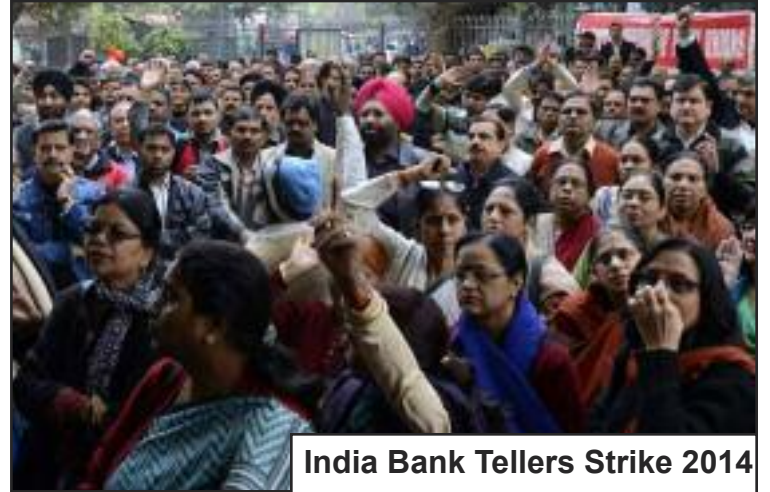
India Bank Tellers Strike 2014

Exposing Modi's fascism alone will not liberate the working class. The International Communist Workers' Party (ICWP) has been patiently struggling to win workers and students in India to fight for communist revolution by joining our party. The working class has no other option to fight for the world we need. India has the world's second-largest standing army, comprised of soldiers who come from the most oppressed working class families. Our goal is to win these soldiers to unite with the working class to smash the capitalist profit system and build communism.