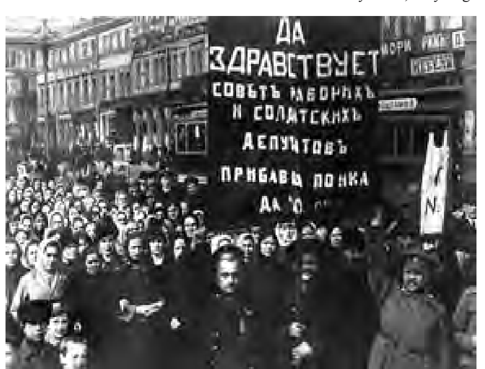
Communist organizing in the czar's army and navy was crucial in the Russian Revolution.