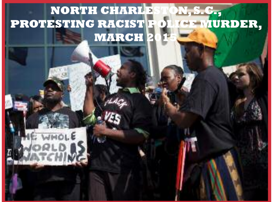
NORTH CHARLESTON, S.C., PROTESTING RACIST POLICE MURDER, MARCH 2015