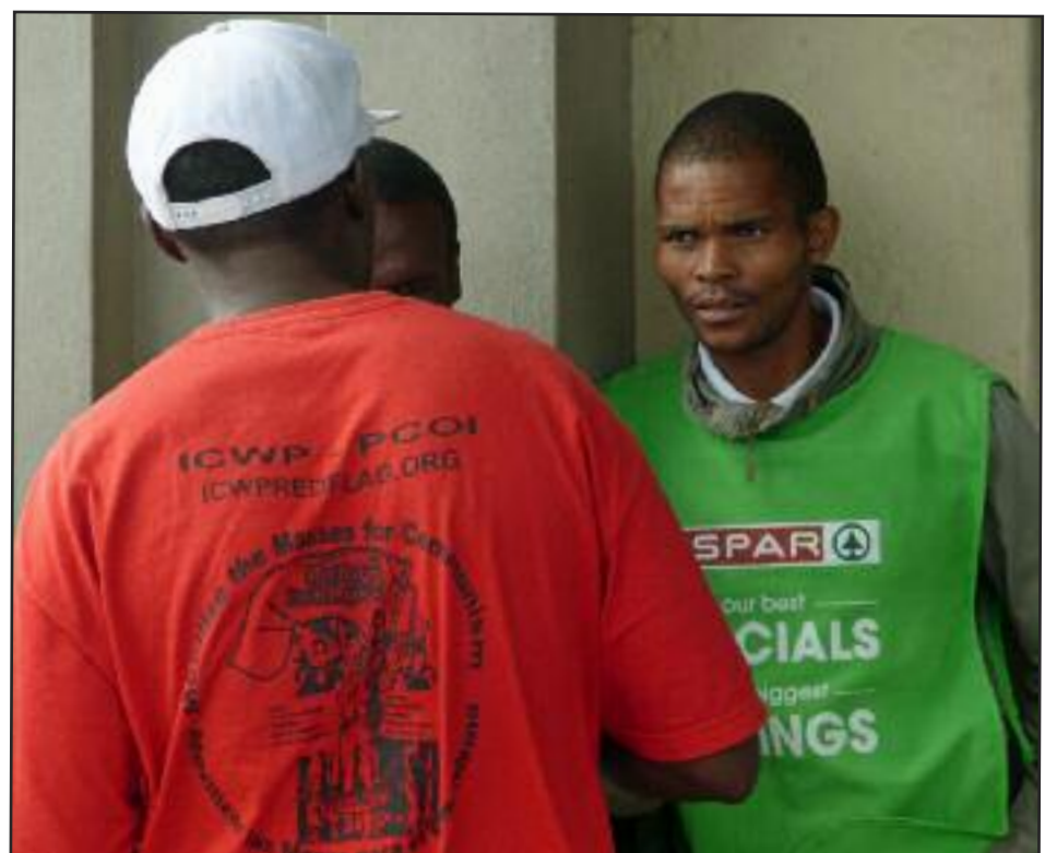
Building ICWP in South Africa

We will also be starting with our classes on dialectical materialism with those comrades we recruited at an Economic Freedom Fighters rally on May Day. These were the comrades who sang the Internationale in Xhosa.