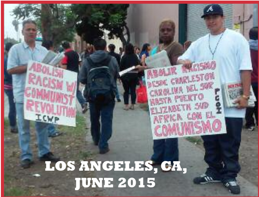
LOS ANGELES, CA, JUNE 2015