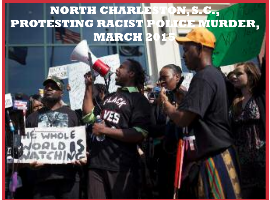
NORTH CHARLESTON, S.C., PROTESTING RACIST POLICE MURDER, MARCH 2015

Bosses Want to Super-Exploit Janitors Equally