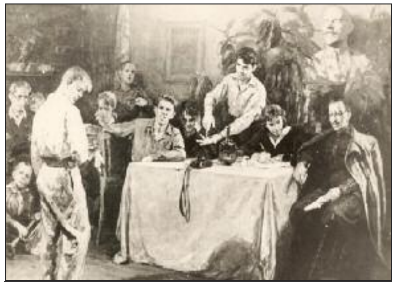
Meeting at the Gorky Colony, 1920s

All quotations from The Road to Life: An Epic of Education by Anton Semyonovich Makarenko