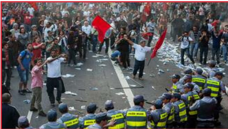
TEACHERS IN BRAZIL