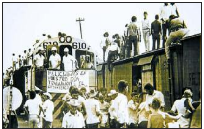
1954 General Strike

In view of the farmworkers' desperation, an intensification of the struggle is expected in the