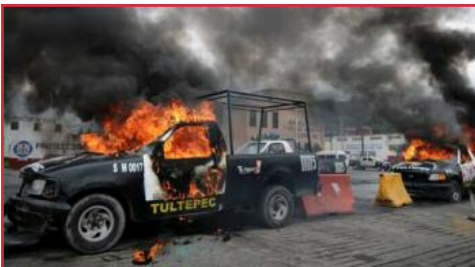
MEXICO, SEE PAGE 4

BOEING & MTA WORKERS BUILD COMMUNIST SOLIDARITY WITH BRAZILIAN MASSES PAGES 3 & 4