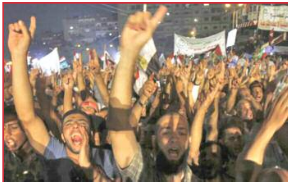
EGYPT, SEE PAGE 8