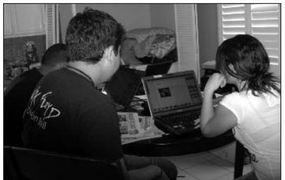
Summer Project Volunteers Working on Red Flag

In a communist system workers decide the future of the working class of the world. We need to wake up and fight back. Instead of asking, “How long can I last?” we should ask, “How long until our class can get rid of capitalism?” Postal workers need to read and distribute Red Flag to build this fight now.