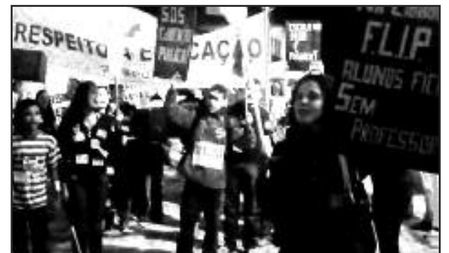
Striking Brazilian Teachers Protesting Bosses' Literary Festival Need to Learn to Fight for Communism More Next Issue

Read and distribute Red Flag , the newspaper of the international working class.