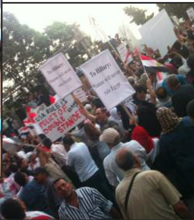
Struggle sharpens in Egypt Above: Textile Workers on strike Right: Protest against US Secretary of State Clinton