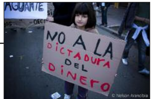
NO TO THE DICTATORSHIP OF MONEY

One more time, capitalism demonstrates its savagery. Workers from the cities to the fields, united with soldiers, must carry out the struggle to eliminate once and for all this system which keeps the working class in abject poverty. Only when we Mobilize the Masses for Communism will we be able to put an end to all this capitalist trash. This will only be possible if we take our ideas to thousands of workers by distributing Red Flag . Only then can we win the new communist society.