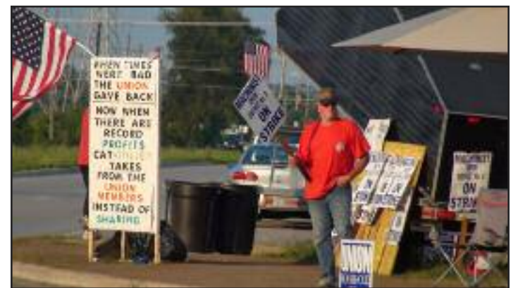
JOLIET, IL—Eight hundred Machinists have been on strike since May 1 against Caterpillar's demands for wage cuts and other concessions. IAM's call for "sharing" obscures the fact that profits are 100% stolen from workers' labor. Together with patriotism, pacifism, and reliance on the bosses' laws, this class-collaborationism is a deadly distraction for the working class.

The ICWP calls on all soldiers and workers, including veterans, to join us in mobilizing the masses for communism. We have a world to win!