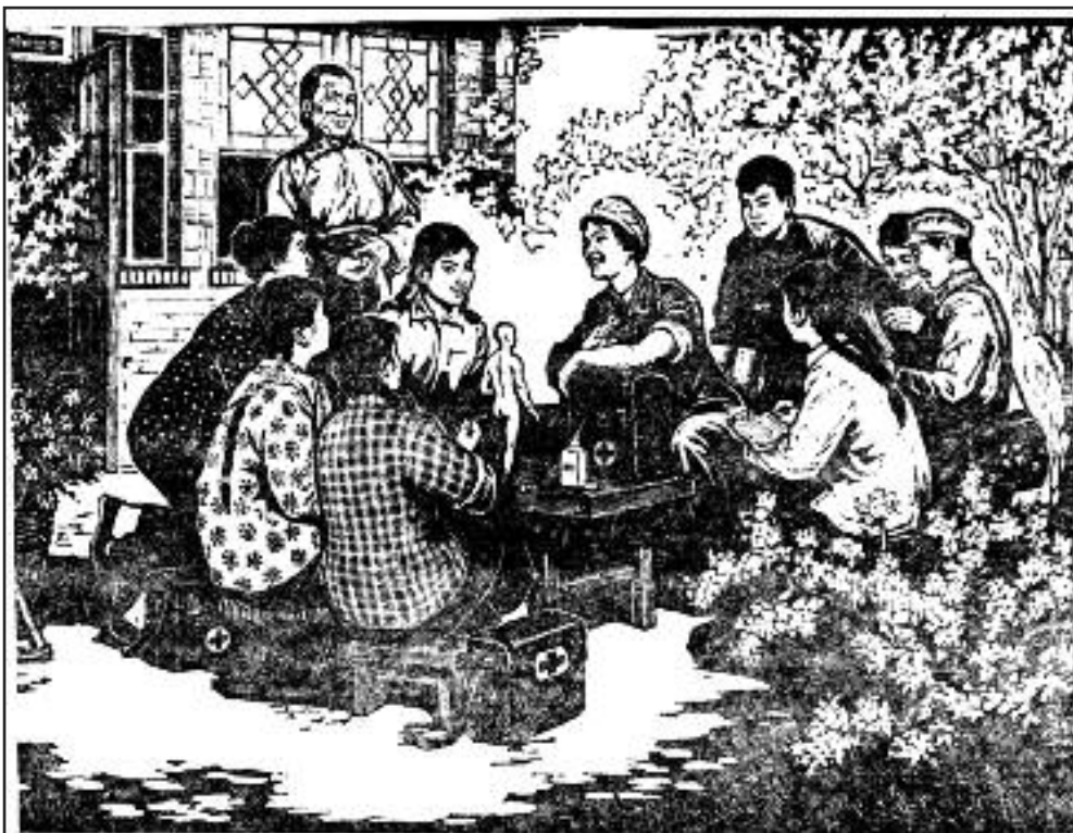
Communist barefoot doctors bring healthcare to rural China

So now we say: Mobilize the masses for communism as if your life depended on it – because it does!