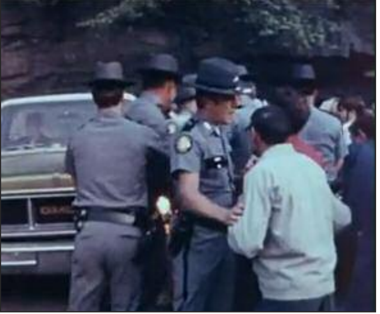
Militant miners in Harlan County, West Virginia, fought cops and scabs in 1976 to win a union contract, but West Virginia miners today still face capitalism's murderous conditions.

Communist revolution will eliminate these butchers. Then we will make this world livable for communist generations to come. Join this historic struggle!