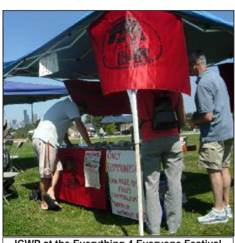
ICWP at the Everything 4 Everyone Festival