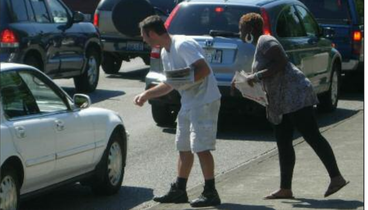
Summer Project volunteers distribute Red Flag to Boeing workers

There are many more like him! "Mobilizing the Masses for Communism" is not only a slogan to guarantee the revolution will succeed after we take state power. It means that even workers new to our politics can help develop this movement. As a veteran teacher told a crowd of people grappling with the possibility of communist revolution: "The future is bright!"