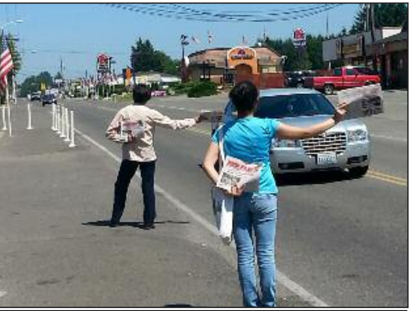
Summer Project Volunteers Take Communist Ideas to Soldiers at Joint Base Lewis-McCord