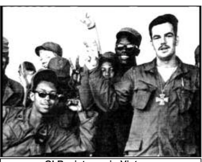
GI Resistance in Vietnam

All industrial workers who read Red Flag should encourage their young relatives to join the army to mobilize their fellow soldiers for communism. In this way, we will prepare the soldiers of the world to ally with the workers of the world to fight for communism.