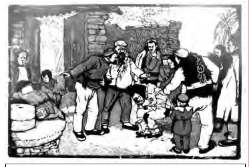
A Chinese woodcut showing workers in a communist society struggling with someone who doesn't want to work that he should be part of the collective.