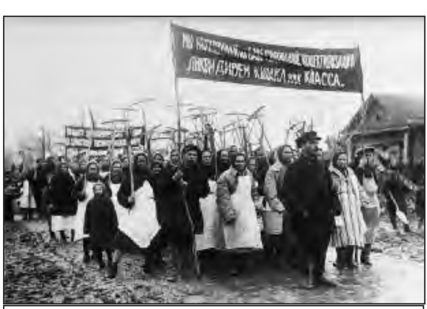
Russian farmworkers march to collective farms.

Before we began, we read an article in Red Flag about the farmworkers and also stressed the idea of thinking about the document Mobilize the Masses for Communism , and how we can put it into practice in our places of work or study. We plan to continue to visit the fields regularly as part of this struggle to mobilize masses of workers for communism and build a mass ICWP.