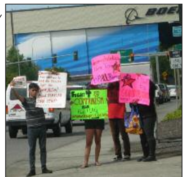
ICWP Seattle Summer Project

A new friend from Spain accompanied us back to our Summer Project BBQ. Indeed, the future is bright.