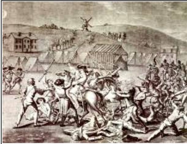
Communist members of Conspiracy of Equals try to incite soldiers to mutiny.

Much work in !Kung San society is collective (gathering expeditions, hunting large animals). The products of such work are shared according