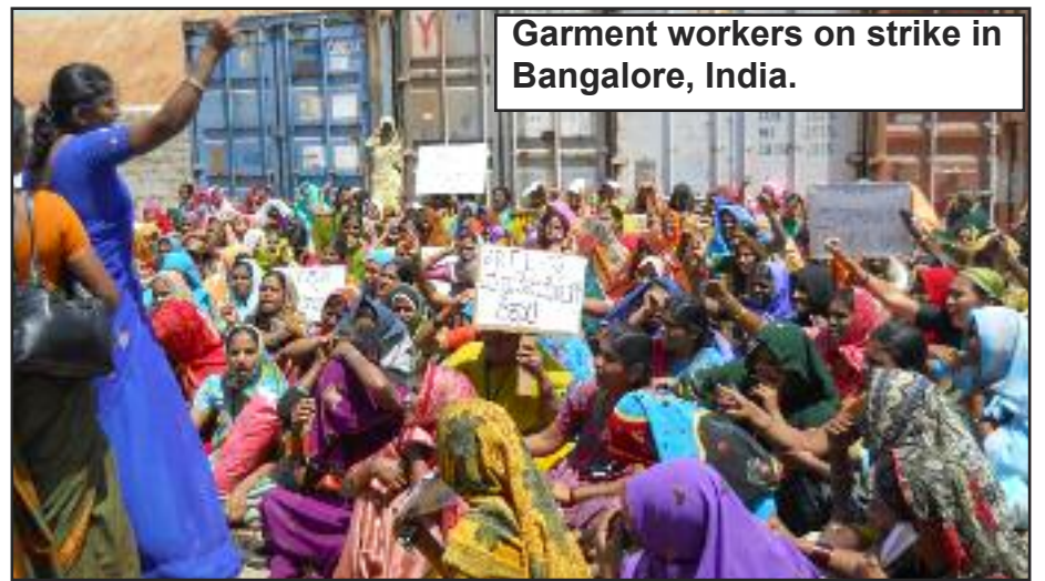
Garment workers on strike in Bangalore, India.

Many understand that it's ICWP and Red Flag who represent the interests of our class. Day by day more workers are asking for copies of Red Flag for their co-workers. And as a worker from Division 1 said, "Give me four papers and in the end we'll see who laughs last." There's a lot of discontent. It's up to us, the members of ICWP and Red Flag readers inside MTA, to give a form, a cohesion, to this discontent through organizing clubs in the different divisions integrated with mechanics, drivers, and service attendants. And like another worker said, they screwed us again, but we must organize to get kick these traitors out and organize new methods of struggle.