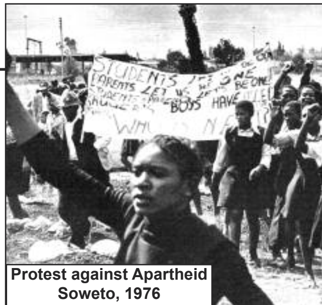
Protest against Apartheid Soweto, 1976

A reconciliation process ended Apartheid in 1994. Nelson Mandela and the Communist Party were unbanned. An officially “non-racial” capitalist state was established. The legacy of Apartheid, and the nature of capitalism itself, however, have made South Africa the most unequal country in the world for all racial groups. While there are now poor whites, there are also rich and powerful, cops