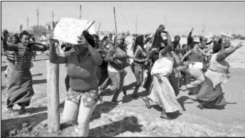
Wives of Lonmin miners protest police massacre.

One student said he supported democracy. When a Red Flag seller explained that democracy was invented by Greek slave-owners to justify class society, the student laughed heartily and said, "I'll read this paper!"