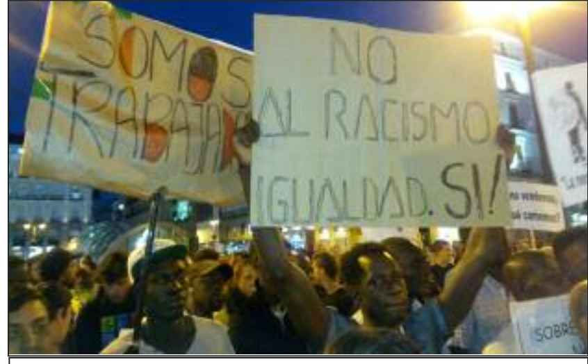
Madrid: Protest against police attacks on immigrant street venders. Signs read"We Are Workers" and "No to Racism! Equality Yes!"

We must take and spread communist ideas everywhere and tell the workers of all colors that we are the same class, that we are not different and that we must unite to overthrow capitalism. We have to find a better quality of life regardless of colors or nations.