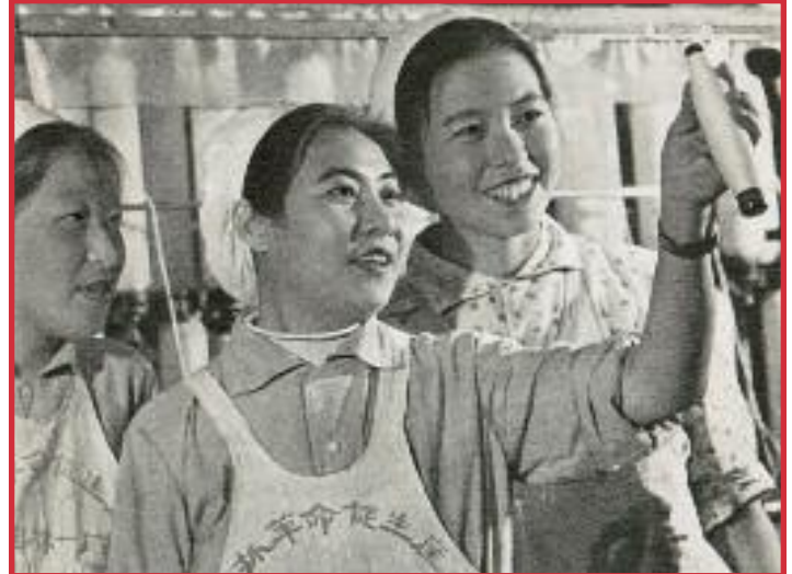
Wu Kuei-hsien, cotton mill worker, became Vice-Premier of the People's Republic of China

Today the International Communist Workers' Party (ICWP) has a very different idea. We aim to build a mass party embracing everyone willing to help mobilize even broader masses for communism. Our collectives help all members to take leadership around this, in big ways or small. We expect that, a generation after we've won