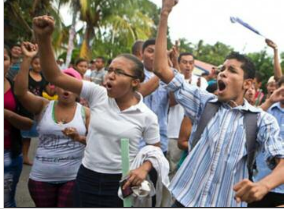
Sign reads "The lake is life. The canal is death." Since December 2014, tens of thousands of Nicaraguans (mostly farmers) have protested the Ortega government's massive land-grabs and evictions for the proposed canal. Some once supported the U.S.-backed fascist Contras against the first Sandinista government in the 1980s and might look to the US again for support against Ortega and his Chinese business partners. Others are former Sandinista fighters, once Ortega's strongest base. "I don't want a canal—that's for capitalists," one said. We must seize this opportunity to get Red Flag into the hands of the angry Nicaraguan masses.