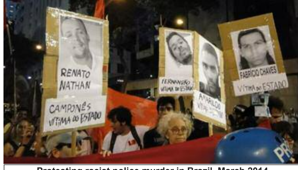
Protesting racist police murder in Brazil, March 2014

We have a network of readers of Red Flag in Brazil and other areas of the world. These should readers join the International Communist Workers' Party (ICWP) to