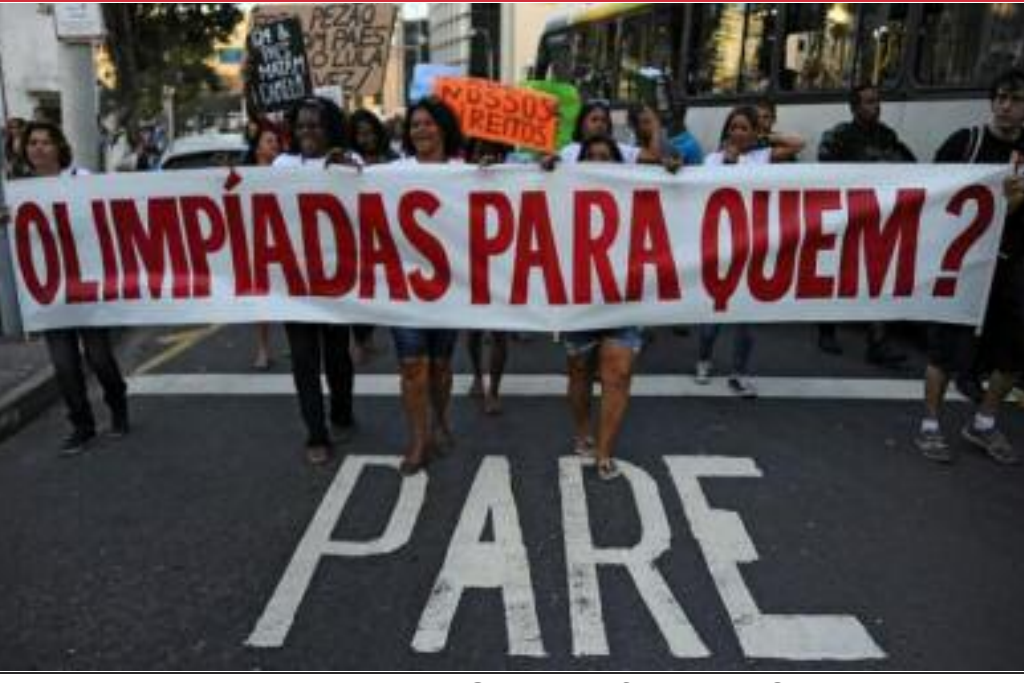
Protest in Rio: "Olympics for Whom?"

In these last two weeks Rio de Janeiro has hosted the Summer Olympics. The values of "unity, brotherhood and equality" that these types of events try to promote are completely the opposite of what they really represent. These competitions serve to promote nationalism, xenophobia,