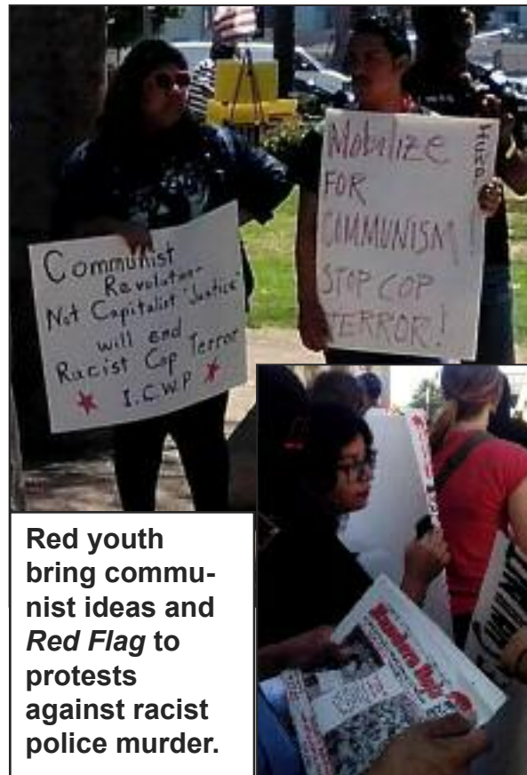
Red youth bring communist ideas and Red Flag to protests against racist police murder.

This has only gotten worse since 9/11, when