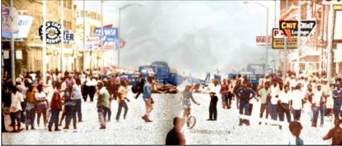
The 1967 Detroit rebellion, shown above, rocked the US bosses’ system. The 82nd Airborn was diverted from Vietnam to occupy the city.

Showing their fear of the angry masses, DC security guards grabbed signs about Trayvon and the racist system out of some peoples’ hands. But