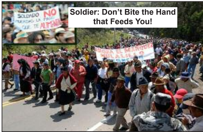
Soldier: Don't Bite the Hand that Feeds You!

Spread the class struggle far and wide through