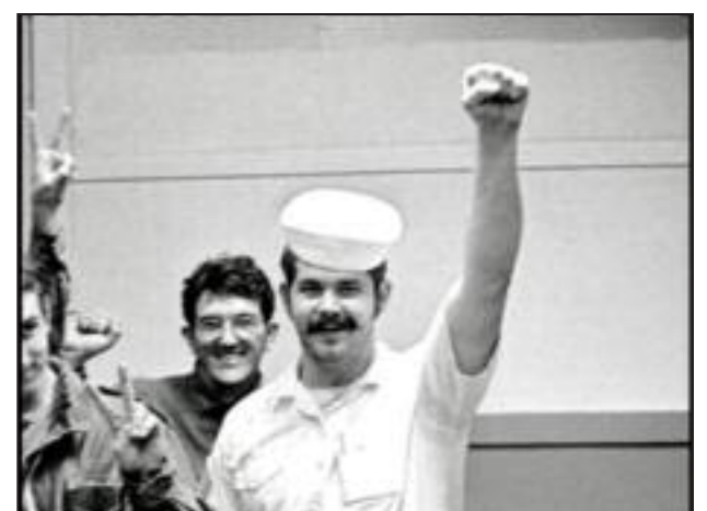
Thousands of Sailors and Soldiers During the Vietnam War Refused to Carry Out the Murderous Orders of the US Imperialists

But we have another option, and that option is to take matters into our own hands and build a communist revolution that fights for the needs of workers around the world. We should build on the unpopularity of war among workers, soldiers and sailors and spread communist revolutionary ideas so that we lay the groundwork for a communist society. In these moments, soldiers can play a key role in leading the whole working class in fighting to turn the bosses’ wars for profit and empire into a fight for communist workers’ power.