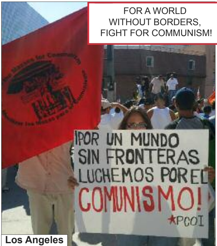
FOR A WORLD WITHOUT BORDERS, FIGHT FOR COMMUNISM!

THE INTERNATIONAL COMMUNIST WORKERS' PARTY * WWW.ICWPREDFLAG.ORG