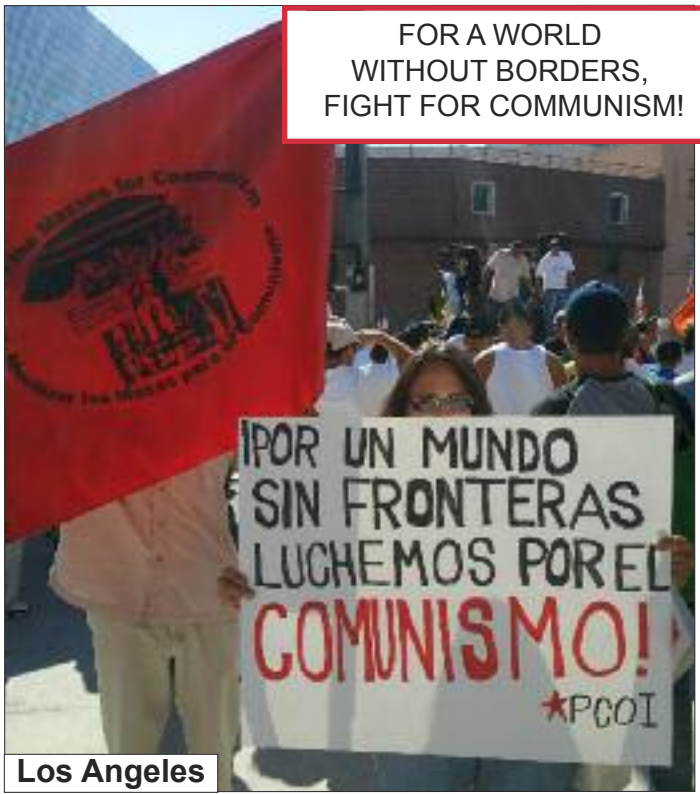
FOR A WORLD WITHOUT BORDERS, FIGHT FOR COMMUNISM!

THE INTERNATIONAL COMMUNIST WORKERS' PARTY * WWW.ICWPREDFLAG.ORG