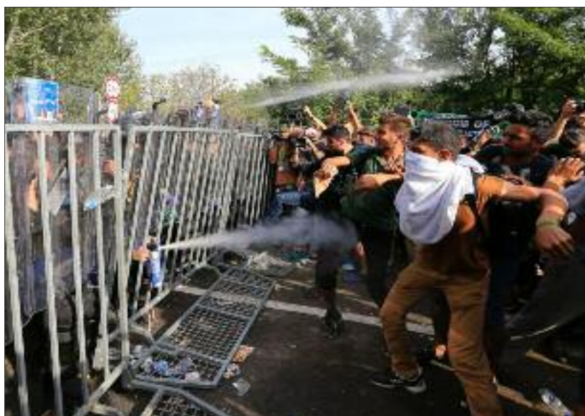
September 16--Hungarian police pepper-spray migrants after they broke down the fence between Serbia & Hungary. This attack forced migrants to go through Croatian minefields.

The deepening contradictions of global capitalism have created a crisis which can only be resolved by communist revolution. There are no national boundaries in the fight for a communist world, where we will work for human need and not for profit—where the international working class will be the human race.