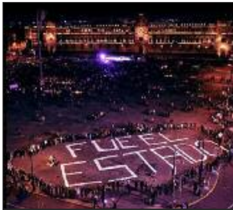
IT WAS THE STATE

Official investigations say that the company owning the buses taken by the students transports drugs to the US.