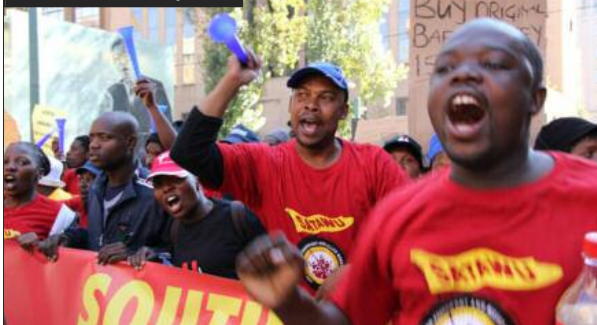
Transnet Strikers, May, 2010

We reported on the Port Elizabeth harbour workers' strike in April. Little did we know that five months later we would be meeting these twenty-eight Transnet workers. They are reported to have lost the battle with the employer at the court. They have been meeting every Sunday for six months, waiting for updates from the Numsa organiser who is reportedly in Johannesburg.