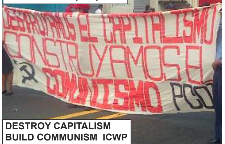
Garment Workers in El Salvador, May Day 2014

leaflets and Red Flag more consistently. These activities must and will be constant. Bringing communist ideas to workers is the work of all the members of the party in whatever part of the world we find ourselves. In this way, we are building communism. Each newspaper in the hands of a worker is another step towards communist revolution.