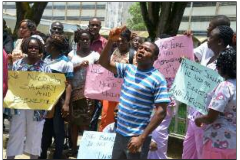
September 2--Nurses strike at John F. Kennedy Hospital in Monrovia, Liberia.

Next on the agenda: showing how the fight for communist health care is an essential part of mobilizing masses for communism.