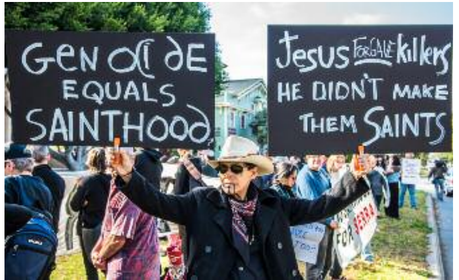
California protests against the canonization of Junipero Serra

The history and present actions of the Catholic