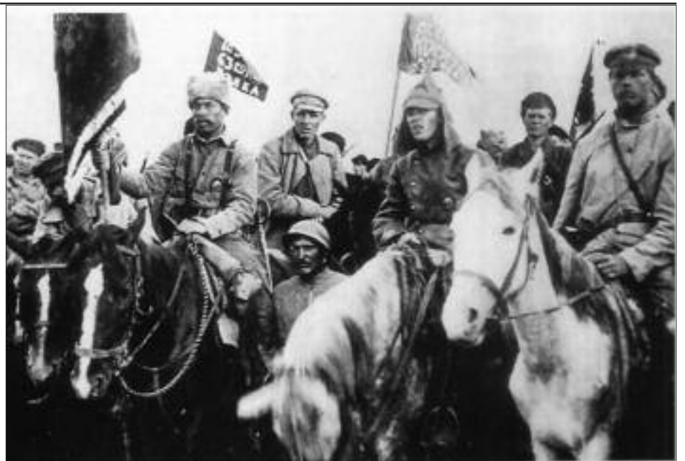
Soviet Red Army Cavalry 1920

He knows technology isn’t decisive to win wars. No sane armed force would frontally attack what he calls “a wall of steel,” a frontal attack on a well-armed enemy with mass troop strength. Dispersion of many troops over hundreds of