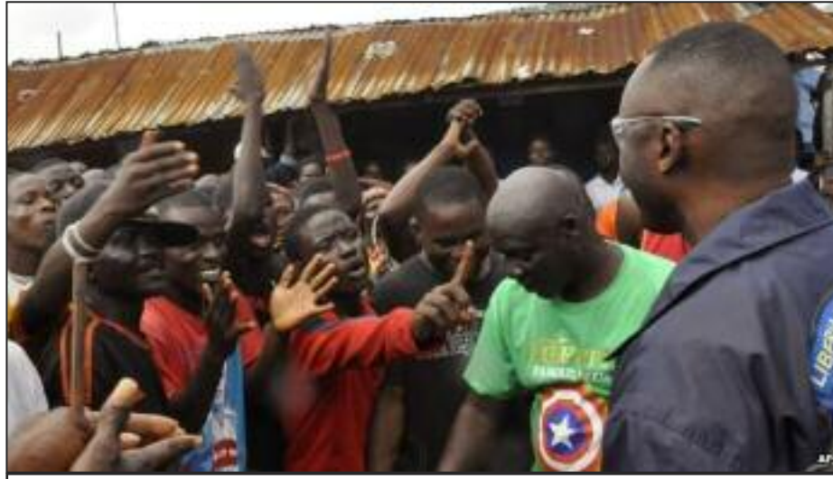
Angry Liberian workers confront fascist police terror during Ebola epidemic

In the 1970s a number of African countries had government-sponsored medical care. In the 1980s some got into debt trouble and asked the International Monetary Fund (IMF) to bail them out. As usual the IMF imposed a series of "structural adjustment policies" as a condition of the loan. These conditions aim at making sure that governments cut back spending for things like medical care or food subsidies, so the big banks will get paid back at the expense of the working class. The World Bank and the IMF want everyone to be dependent on