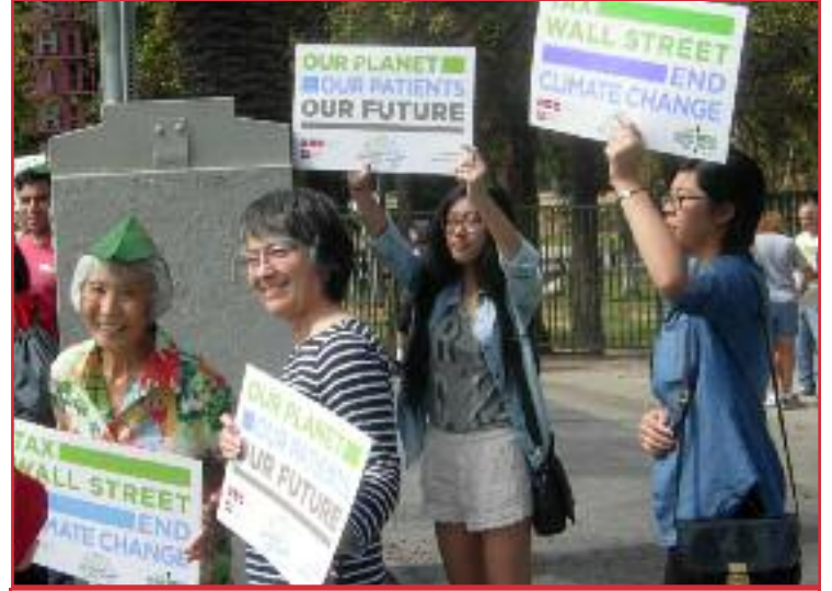
LOS ANGELES, Sept. 20—California Nurses’ Association joins climate protest. ICWP comrades distributed Red Flag and opened discussions about how capitalist competition for maximum profit drives everything, including the growing climate crisis. We explained that only mobilizing the masses for communism – not “taxing Wall Street” or other reforms – can end the evils of this deadly system.

In India, Prime Minister Modi talks out of both sides of his mouth. Sometimes he denies that climate change is an issue; at other times he brags about fighting it. But the Modi government has doubled the carbon tax from $8/ton to $16/ton and increased the budget for solar power. The Indian capitalists may see climate negotiations as a