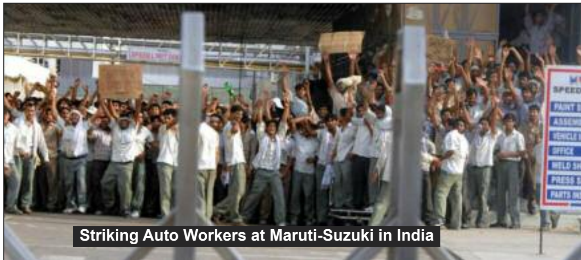
Striking Auto Workers at Maruti-Suzuki in India

This forced the auto bosses to cut costs. And they did it by speeding up work and cutting wages. Where in 2001 the bosses and bankers got $2.63 for every $1.00 they invested in wages, by 2010 they got $6.14 for every $1.00 they invested. It was a vicious assault on an already impoverished working class. In India's main auto production area just outside Delhi, 80% of the 1 million workers are now hired 'on contract' (non-permanent), others are 'trainees' and still others 'apprentices. All three categories pay less than permanent jobs.