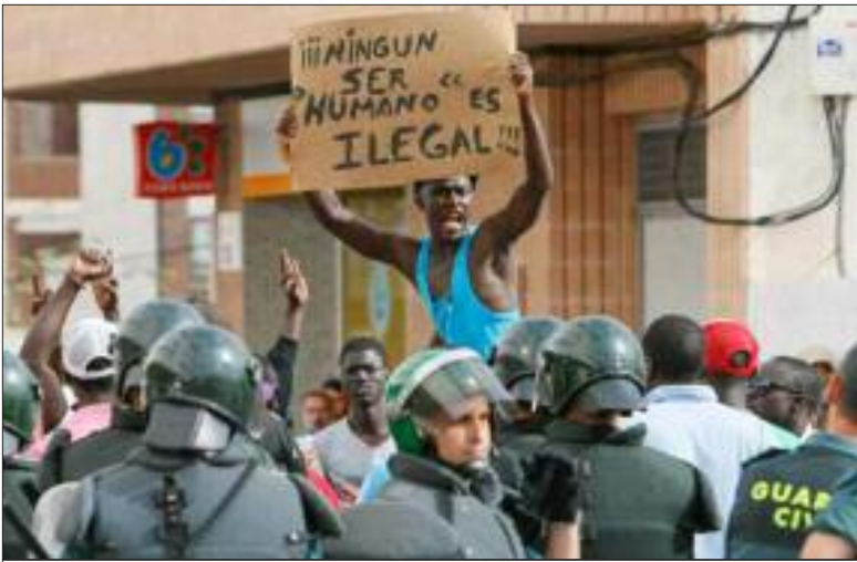
SPAIN: No Human Being is Illegal!

The ICWP is now more than ever working to continue spreading communist ideas, coming up with new ideas about how to distribute Red Flag . We know we now must redou-