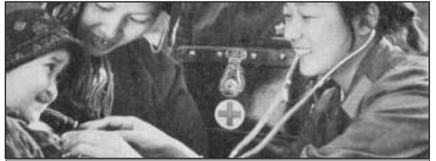
Chinese “barefoot doctor” with ethnic minority patients

2015: Thousands of students at two high schools rebelled after hundreds were hospitalized for food poisoning.