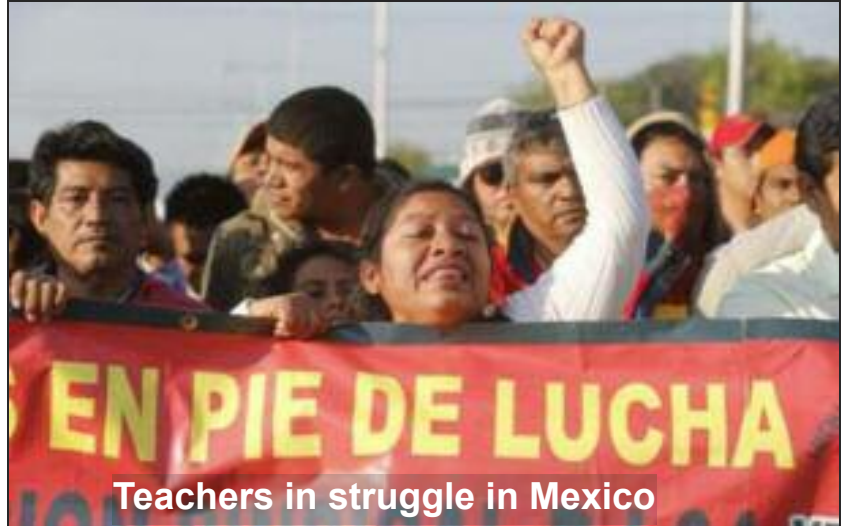
Teachers in struggle in Mexico

Unfortunately they followed the nationalist and reformist examples of the old movement, now under Chinese and Cuban influence.