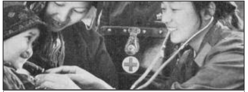
Chinese “barefoot doctor” with ethnic minority patients

2015: Thousands of students at two high schools rebelled after hundreds were hospitalized for food poisoning.