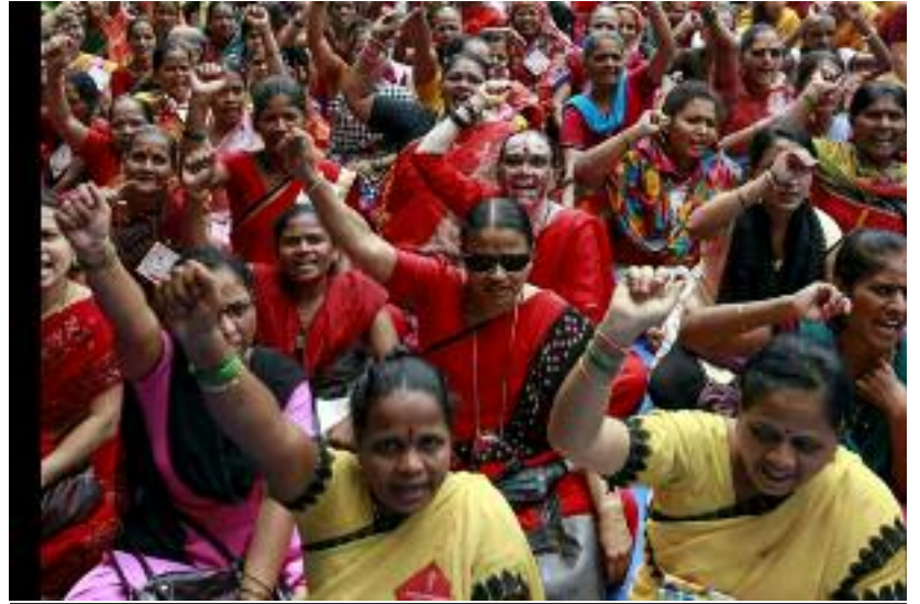
Mass anger in India over lynching of Mohammed Ahkmaq

However, neither the Congress party nor the so-called progressive nationalists can end the rule of the fascist BJP. Communism and only communism using mass revolutionary violence can smash the religious fanatics and their cynical at-