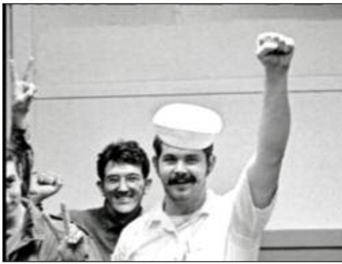
From the Potemkin uprising in the Russian Navy in 1905 to the mutiny on the USS Kitty Hawk during the Vietnam War, sailors have played an important role in the struggle of the working class.

One top of the lack of privacy, there is a lack of trust in the qualification of the ship's doctor. Whereas in hospitals there are specialists in par-