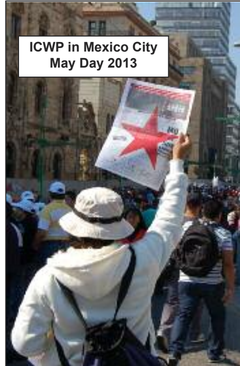
ICWP in Mexico City May Day 2013

The revisionists or followers of the old socialist movement, even those who advocate the “armed path” pursue the goal of a “democratic republic” which is “anti-imperialist.” They lament the theft that “savage capitalism” carries out against the farmworkers as it industrializes, but they do not believe that wage slavery needs to be abolished now! We in ICWP see the growth of the working class and the proletarianization of the farmworkers as inevitable and as an opportunity to fight for the emancipation of humanity. Join us!