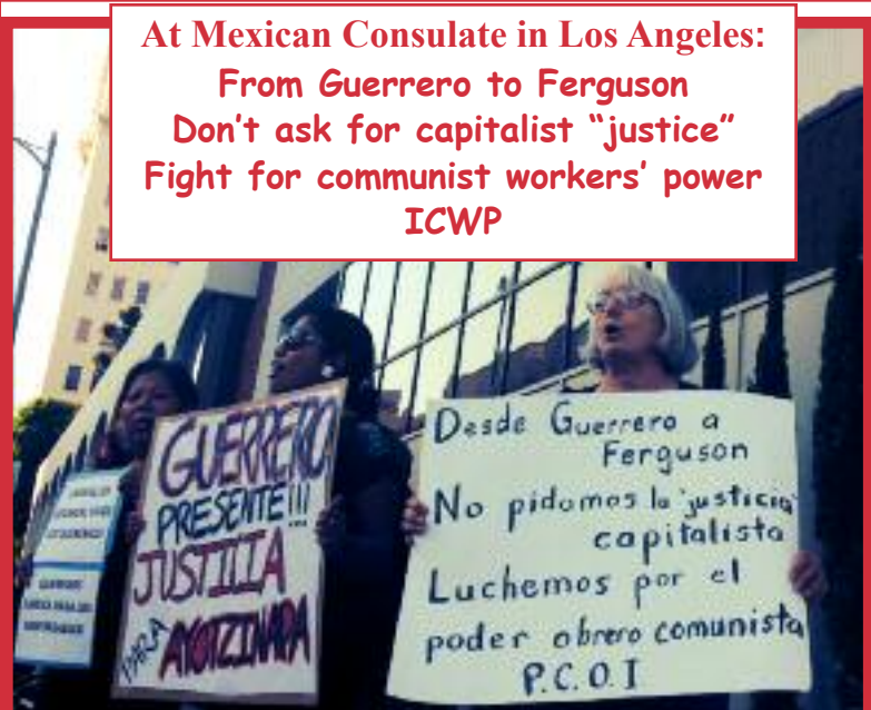
At Mexican Consulate in Los Angeles: From Guerrero to Ferguson Don't ask for capitalist "justice" Fight for communist workers' power ICWP

Mexico: Seizing radio stations, blocking entrances to banks, burning the city hall and the government palace in Chilpancingo, students and teachers protested militantly and massively. We invite them and the whole international working class to join us in building a revolutionary communist movement that burns down all of capitalism so that on its ashes we can build a communist world.