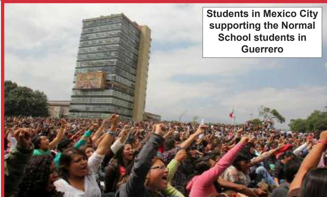
Students in Mexico City supporting the Normal School students in Guerrero

THE INTERNATIONAL COMMUNIST WORKERS' PARTY * WWW.ICWPREDFLAG.ORG