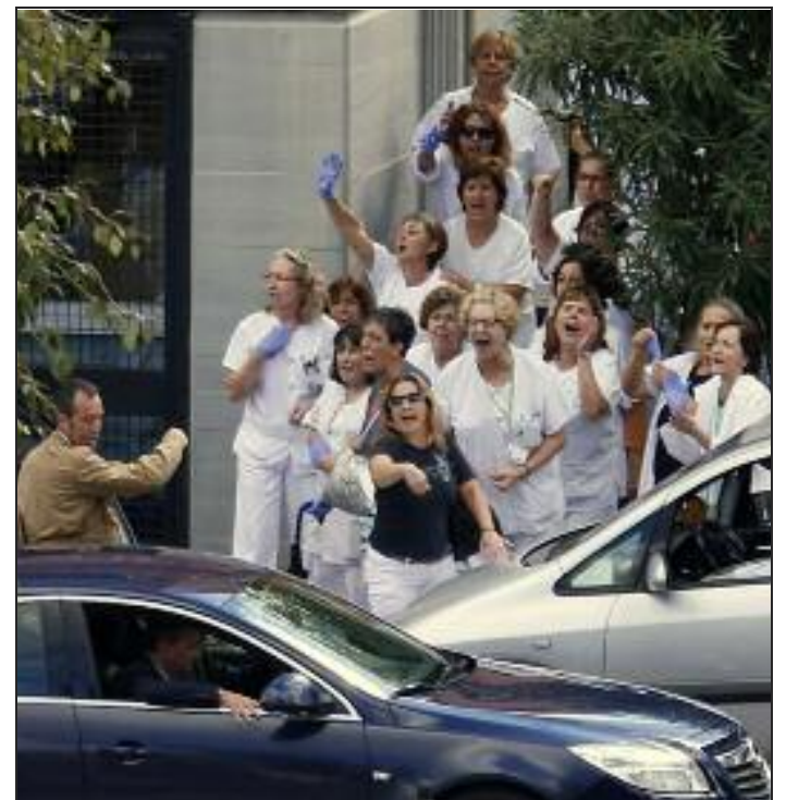
Healthcare workers in Madrid, Spain, furious at cutbacks and inadequate protection, throw surgical gloves at the prime minister after a nurse caring for an Ebola patient contracted the virus.