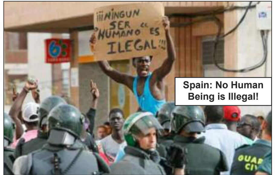
Spain: No Human Being is Illegal!

Today, the worldwide crisis has wiped out millions of industrial jobs in Europe and led to mass mobilizations of angry pensioners and young workers. At the very moment that the crisis has brought more immigrants to Europe, the industrial jobs that European citizens had relied on are being outsourced. European workers are taking