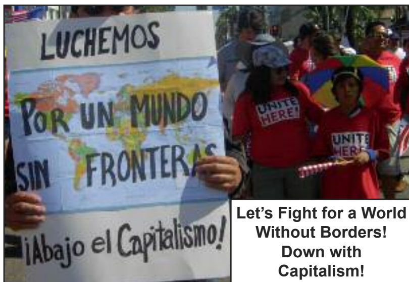
Let's Fight for a World Without Borders! Down with Capitalism!

I accepted the responsibility, although I was still vacillating a little. But during the week, with each call to other comrades and friends in the base and their positive responses, I began to gather more confidence. We also prepared some signs that we would use.