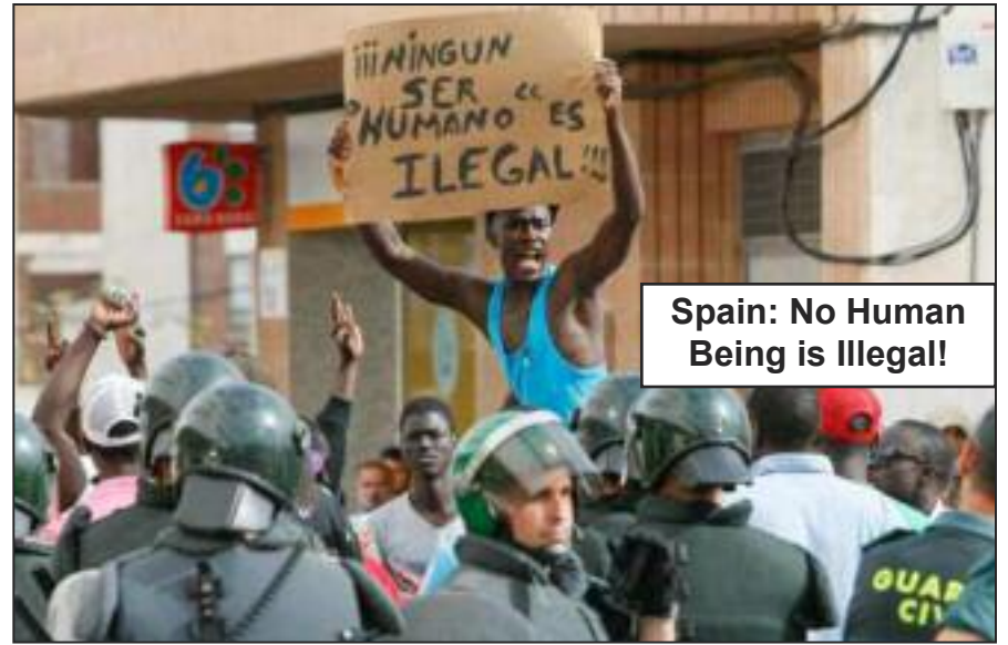
Spain: No Human Being is Illegal!

Today, the worldwide crisis has wiped out millions of industrial jobs in Europe and led to mass mobilizations of angry pensioners and young workers. At the very moment that the crisis has brought more immigrants to Europe, the industrial jobs that European citizens had relied on are being outsourced. European workers are taking