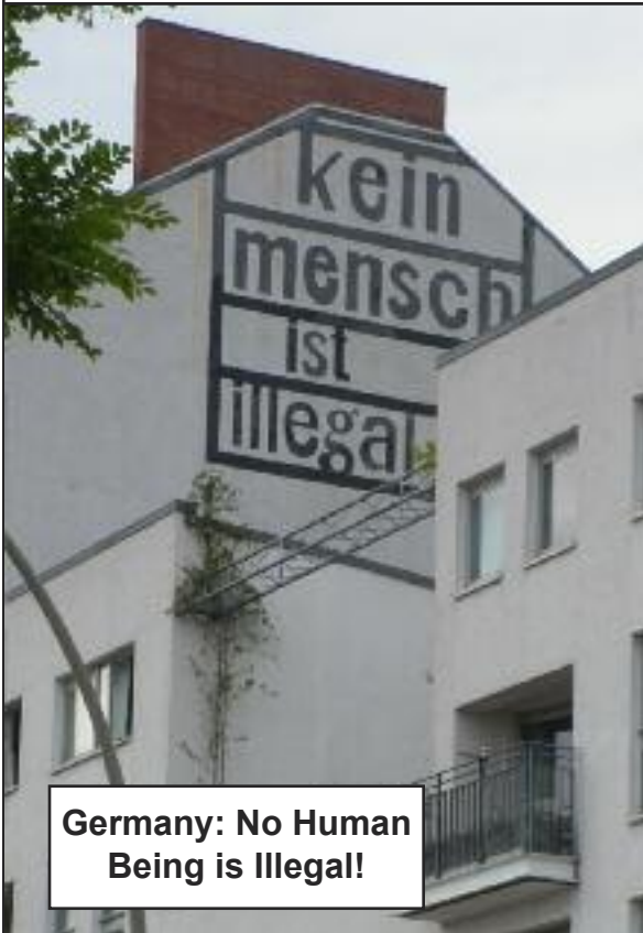
Germany: No Human Being is Illegal!

THIS IS THE PAPER OF THE WORKING CLASS. WE GET NO FUNDING FROM THE CAPITALISTS, THEIR FOUNDATIONS OR NGOs. PLEASE GIVE GENEROUSLY TO HELP PAY FOR THE COSTS OF PRODUCTION AND DISTRIBUTION.