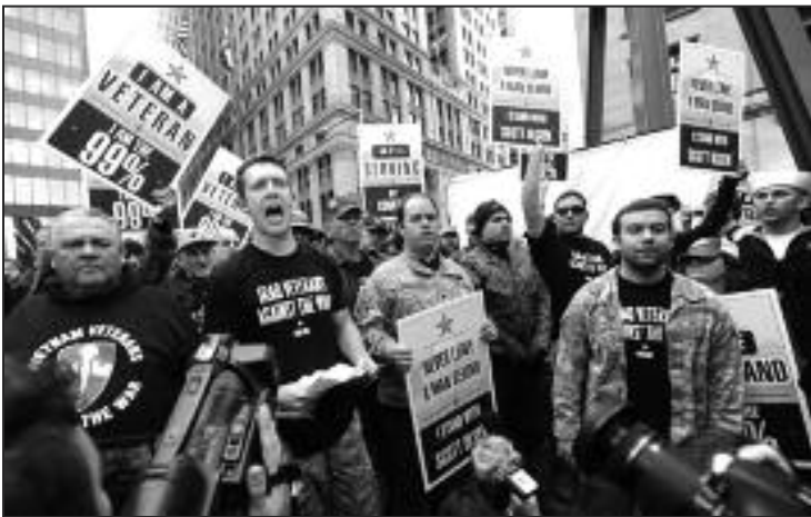
Angry Veterans of US wars from Vietnam to Iraq protesting at Occupy Wall Street. Soldiers and sailors are key to communist revolution; see articles on page 4

As the Asia-Pacific region, however, becomes less dependent on external markets, US influence will dwindle and China’s will grow exponentially. New trade alliances can make old military alliances obsolete. Hillary’s claim that “America has the capacity to secure and sustain our global leadership in this century as we did in the last” will be tested on the battlefields of WWII. Our task is to win workers and soldiers to turn the imperialist war into a class war for communism.