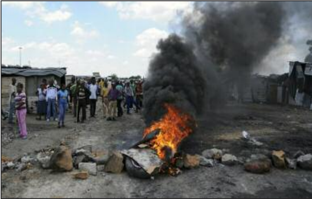
South African Miners: the struggle continues

Next issue: Bringing the South African rebellions to the Boeing plants. We can mobilize for communism now!