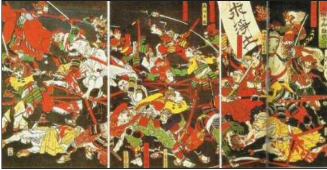
The Battle of Azukizaka was the climactic clash between Ieyasu and the Ikki.

Chinese historians since the 1970s have studied these movements closely. They found it difficult, often, to distinguish genuine radical leadership from the personal ambitions of warlords. It's also hard to identify the political goals of peasant rebels, since the written records were made by and for the feudal rulers.