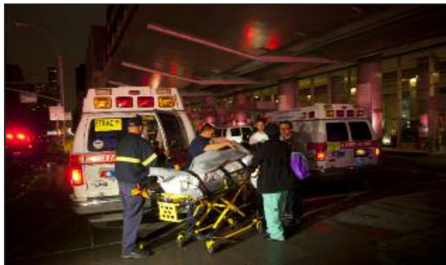
Hurricane Sandy forced evaluation of hospitals