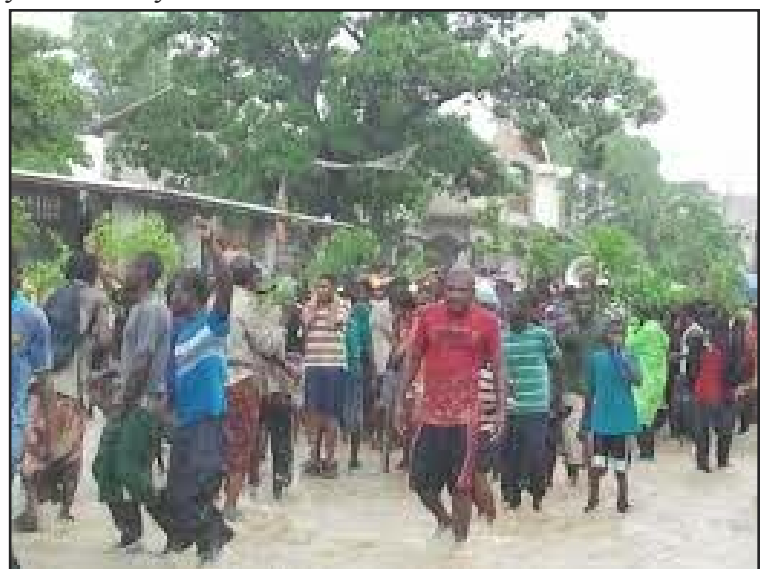
Hurricane Sandy tore through Haiti and other Caribbean islands, killing over 70 people before smashing into the northeastern United States. In Haiti, half a million workers are still homeless nearly three years after a devastating earthquake. Now Sandy has worsened the food crisis there, and a cholera outbreak looms. In the city of Leogâne, shown here, workers protested on October 31, in still-flooded streets.

The masses will come up with a multitude of ways to help. There is nothing the working class can't do when freed from the yoke of this bosses' system.