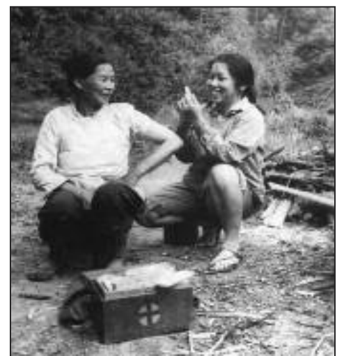
China's barefoot doctors in the 1950s & 60s have taught us valuable lessons about medical care freed from the profit system.

If we were to destroy all borders and all capitalist governments, we'd be able to provide a healthcare system that is much more reasonable and reliable for all, not just for the rich.