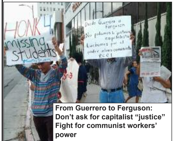
From Guerrero to Ferguson: Don't ask for capitalist "justice" Fight for communist workers' power

Greetings to friends in Guerrero, Mexico. We are a group of high school students in Los Angeles, California. We lament very much the disappearance of our comrades. As we know, this is yet one more of the many incidents committed by the police and governments in all countries. We are part of the International Communist Workers' Party. As its name says, our Party is to support and defend the working class of the world. Our objective is to abolish the capitalist system and put in march a communist system where governments will not exist and neither will bosses who exploit the working class and much less cops that instead of protecting people put fear in us. It will simply be a society in which everyone works according to their abilities and receives according to their needs. We cannot continue to let incidents like this occur anymore. The only solution is to organize ourselves for communist revolution. Friends, you are not alone. Your pain is our pain. Your struggle is our struggle.