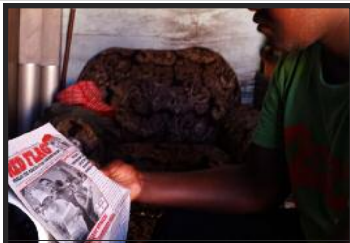
South Africa: as the class struggle heats up, ICWP grows among industrial workers. See article page 1.

Every area in the world is affected by the contradiction of China's growth and the US need to reverse its decline as well as prevent China and other imperialists from dominating the world.