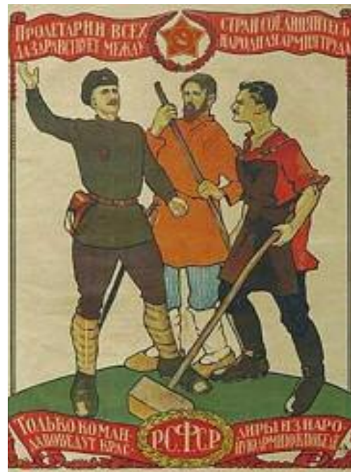
The unity of workers, soldiers and peasants was crucial to the Russian Revolution.

As long as the bosses continue to be thirsty for profits they will send soldiers to fight their wars like in the Middle East, the Ukraine, etc, and to