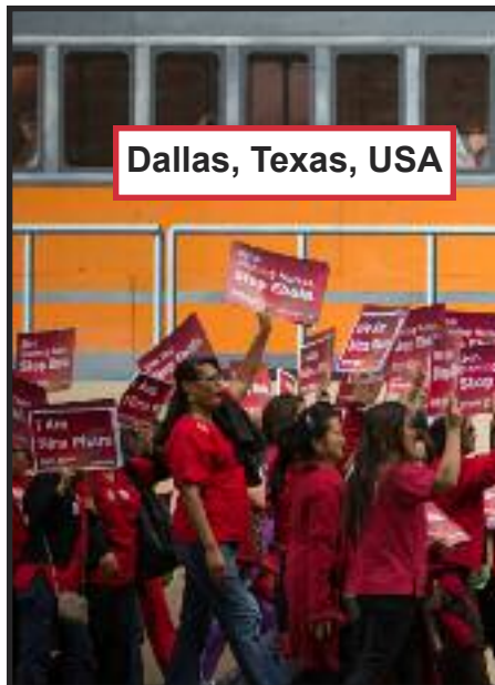
Dallas, Texas, USA

THE INTERNATIONAL COMMUNIST WORKERS' PARTY * WWW.ICWPREDFLAG.ORG