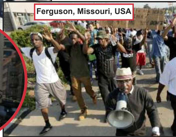
Ferguson, Missouri, USA