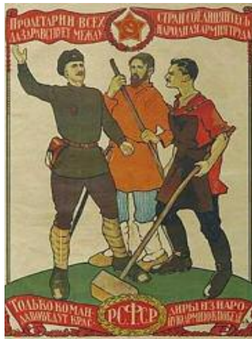
The unity of workers, soldiers and peasants was crucial to the Russian Revolution.

As long as the bosses continue to be thirsty for profits they will send soldiers to fight their wars like in the Middle East, the Ukraine, etc, and to