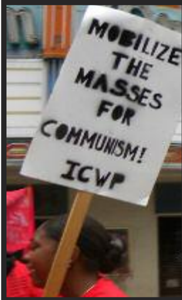
Demonstrations in support of Prop 47, such as the one on the left, funded by corporate donors in Liberty Hill Foundation, seek to steer youth away from a communist solution--see photo on the right.