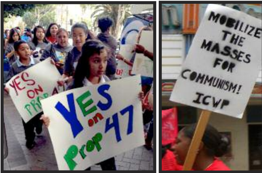
Demonstrations in support of Prop 47, such as the one on the left, funded by corporate donors in Liberty Hill Foundation, seek to steer youth away from a communist solution--see photo on the right.

The small steps we need are to get more workers and youth to read Red Flag . Let's discuss its ideas, and mobilize around them. Readers like you should join the International Communist Workers' Party. Small steps along the communist road will lead to the qualitative change we need.