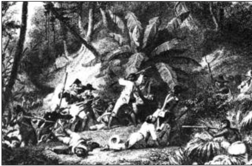
Contemporary Depictions of the Haitian Revolution Dishonestly Show the Victorious Slaves Surrounded by the French

By any objective point of view, Haiti in the late 1790s was the most unlikely place to project a successful revolution against slavery. Plantation slavery was central to the worldwide development of industrial capital. It provided super profits (a slave ship could return a profit of 300% on one