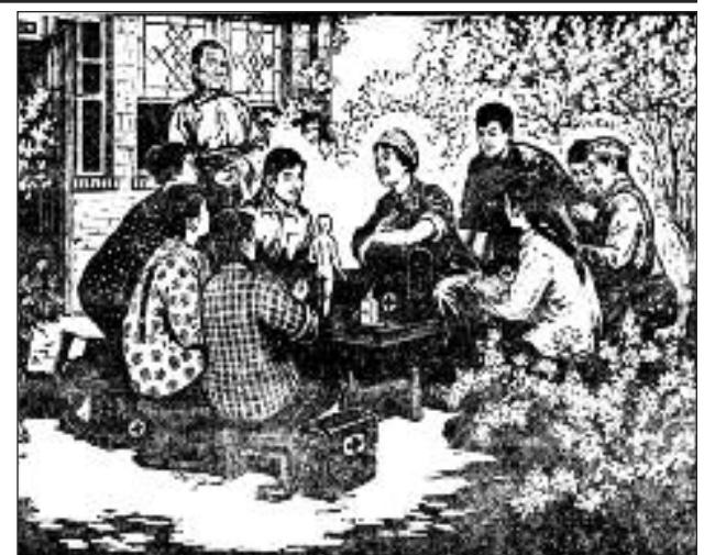
Barefoot doctors in China

Masses of workers are becoming disillusioned with Obamacare and want decent healthcare for all. ICWP and Red Flag need to show our