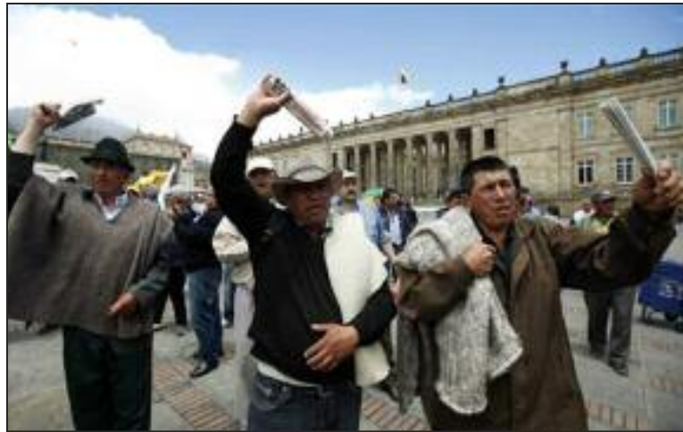
Farmworkers on strike in Colombia, Summer 2013