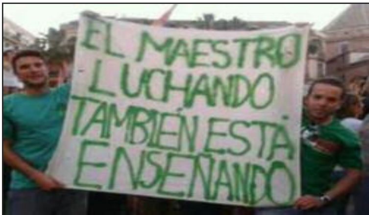
The teacher in struggle is also teaching.

We not only got out a lot of lit, but we have an ever-expanding list of people who are interested in our “pizza and politics” groups. We really need to get out a pamphlet on the question of education. Many people have expressed interest in reading more. It will be very helpful to have at coming events.