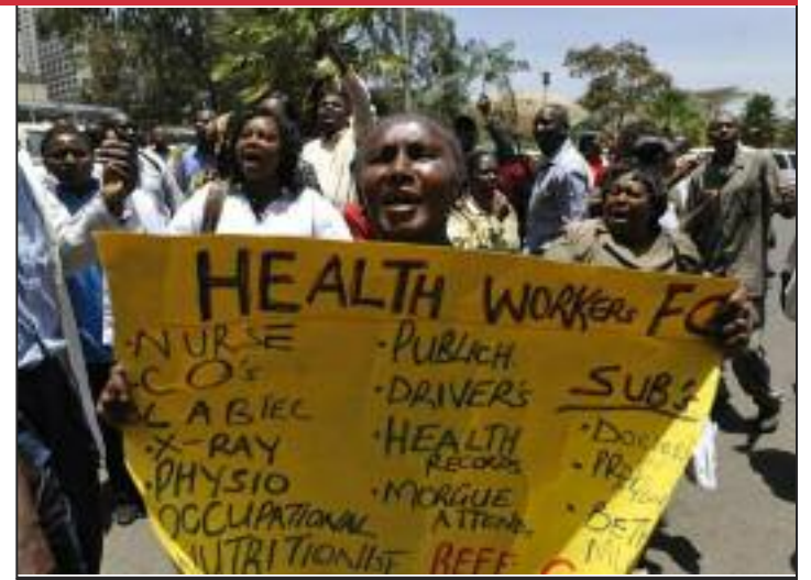
Health Workers on Strike in Kenya, 2012

Many who are seeing that the ACA is an attack are calling for “Single-Payer National Health Care” that eliminates the insurance companies’ profits. They point to Canada as a model. While most workers in Canada get a similar level of care, it doesn’t meet their needs. Many crucial