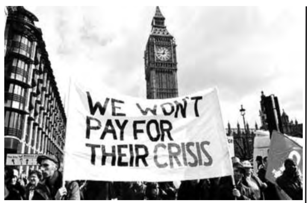
Workers Protest Capitalist Crisis, G-20 Conference, London, Spring 2009

NEWSPAPER OF THE INTERNATIONAL COMMUNIST WORKERS' PARTY * ICWPREDFLAG.ORG