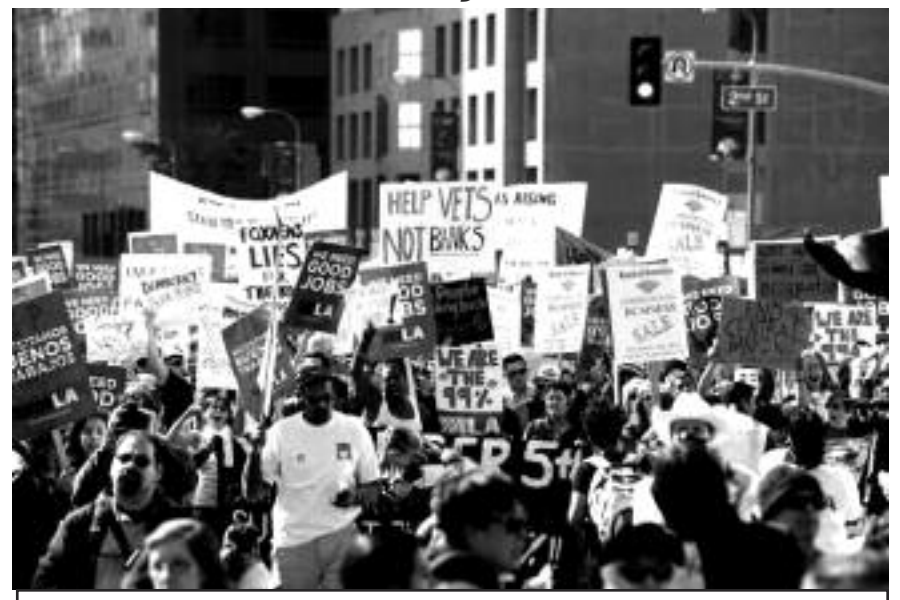
The main printed signs at Occupy LA have been those paid for by the Los Angeles Central Labor Council

A comrade approached a worker who was talking to a union leader. Did they want Red Flag ? The union leader wasn't interested, but the worker said, "Yes—absolutely." The comrade asked him to donate some change. The worker said, "That's not enough for such valuable literature," gave $1, and took another paper for a friend. The unionist sheepishly said, "Give me