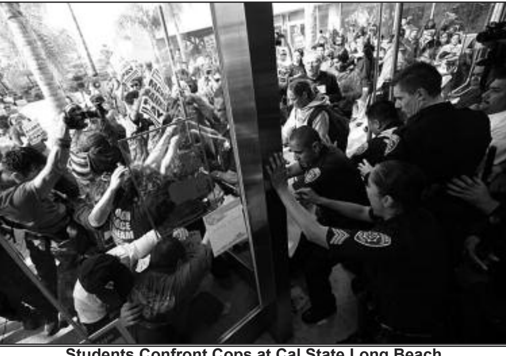
Students Confront Cops at Cal State Long Beach

overproduction leaves no choice for the world's rulers but all-out war – sooner rather than later. They are restructuring schools, colleges, and universities to prepare for this war on the cheap. They need CSUtrained technical personnel for war industries. They need CSU-trained teachers who will